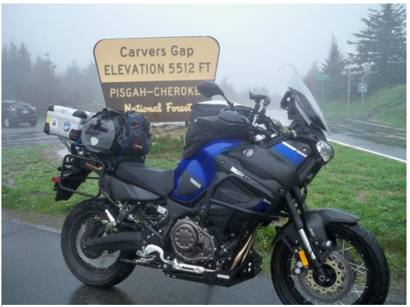
Carvers Gap where I couldn't seem to stand up. It was a really funny moment

A funny story here, one of which I don't have to tell, but will anyway. I'm in nasty weather but still decide to take the Roan Mountain route which because of the elevation becomes even nastier. It's really raining and has even become a little foggy. I park my bike for a photo in front of the Carvers Gap sign (base of Roan Mtn). As I dismount, some small rocks placed there as a landscape border cause me to trip and fall over one of the rocks. If that wasn't enough, as I get up I trip over another rock and go boom again. Please note here that I'm in full riding gear with a rain jacket, pants and helmet and thus not only look like the Michelin Man (in yellow and black) but also move somewhat