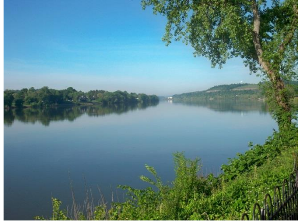
Ohio River at morning

It's now Monday May 6<sup>th</sup> with cool temperatures (high 50's) and clear and beautiful skies with no chance of rain today. My lodging tonight will be at the <u>Lafayette Hotel in Marion, Ohio</u> <u>740-373-5522</u>, which is located right on the Ohio River and decorated in a Riverboat theme. So it's Hwy 91 North out of Damascus, VA up to US 11 and over to Marion where I catch Hwy 16 North from Marion to Tazewell and beyond. The stretch of Hwy 16 from Marion to Tazewell is called the <u>Back of the</u> <u>Dragon</u> and is 33 miles long with 438 curves of all kinds stretching over 3 mountains. This will be my 3<sup>rd</sup> time going from south to north. In a few days I'll be doing it for the 1<sup>st</sup> time from