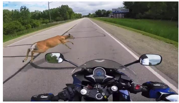
Avoid hitting a deer on your motorcycle

First off, deciding what to do about the wildlife that has suddenly appeared in lane pretty much depends on the animal. Different sizes, types and attitudes demand different responses. You don't respond to a squirrel that can't make up its mind the same way you react to the deer which appears on the road.