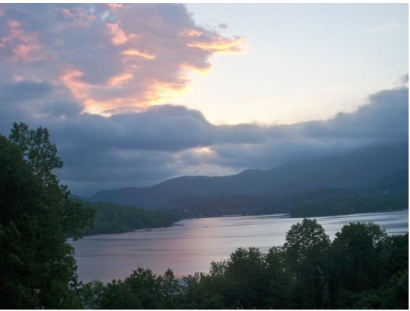
Lake Chatuge from the lodge

(Wolf Pen Gap Road) where we took a left to come back to Suches. We did the loop for a second time going further north and took Hwy 180 east. This allowed us to connect with Hwy 348 (<u>Richard B. Russell Scenic Hwy</u>) down to Hwy 75 and into Helen. We caught Hwy 356 on the outskirts of Helen over to Hwy 197 which took us north up to US 76 and then west into Hiawassee where we had lodging at the <u>Lake Chatuge Lodge</u> located on <u>Lake Chatuge</u>, right next to the fairgrounds and the rally headquarters. Before checking in Ken and I stopped at a restaurant just a block away from the hotel for some wings and a couple of soda pops. Climbing back on my bike, I completely