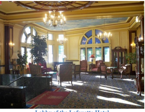
Lobby of the Lafayette Hotel

Virginia and across the Ohio River into Ohio, where I catch Hwy 7 known as the Ohio River Scenic Byway. Please allow me go back here for a minute to say that even beyond Tazewell, Hwy 16 is still full of curves as are parts of US 52; it was really good riding. The sad part here is that both of those roads take you thru some very poor areas of West Virginia where people are struggling to make ends meet as seen by their living conditions and the small towns in general. It made my heart sad and at the same time made me appreciate how lucky I am and have been in life. But now it's Hwy 7 along the Ohio River and I'm working