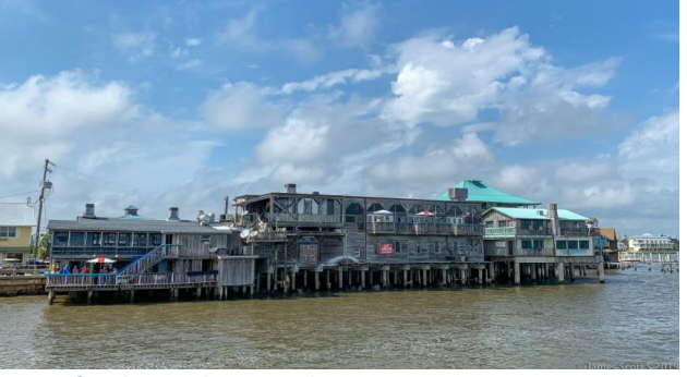
View of Cedar Key business district