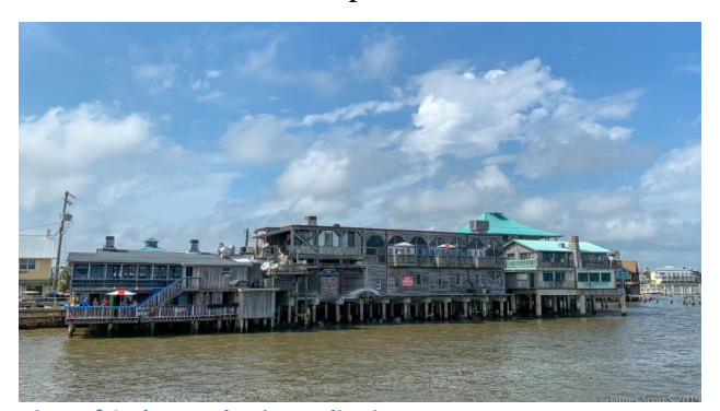
View of Cedar Key business district

head to <u>our photo website</u> and click through the photo gallery posted by James and others. Cedar Key is quite the hang out, with more "down home" local charm than Key West, and it's 5% of the size! You'll also see pics from the Just For Fun Lunch Ride to Peck's. Unfortunately, despite proper planning, there was a scheduling and room assignment SNAFU that led to many riders enduring a l-o-n-g lunch time. Of course, with so many well-traveled attendees, lots of time means lots of stories were brushed off and shared with new