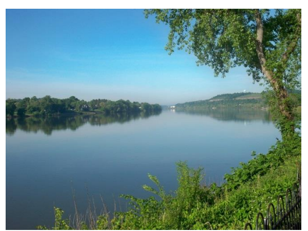
Ohio River at morning

It's now Monday May 6<sup>th</sup> with cool temperatures (high 50's) and clear and beautiful skies with no chance of rain today. My lodging tonight will be at the <u>Lafayette Hotel in Marion</u>, <u>Ohio 740-373-5522</u>, which is located right on the Ohio River and decorated in a Riverboat theme. So it's Hwy 91 North out of Damascus, VA up to US 11 and over to Marion where I catch Hwy 16 North from Marion to Tazewell and beyond. The stretch of Hwy 16 from Marion to Tazewell is called the <u>Back of the Dragon</u> and is 33 miles long with 438 curves of all kinds stretching over 3 mountains. This will be my 3<sup>rd</sup> time going from south to north. In a few days I'll be doing it for the 1<sup>st</sup> time from