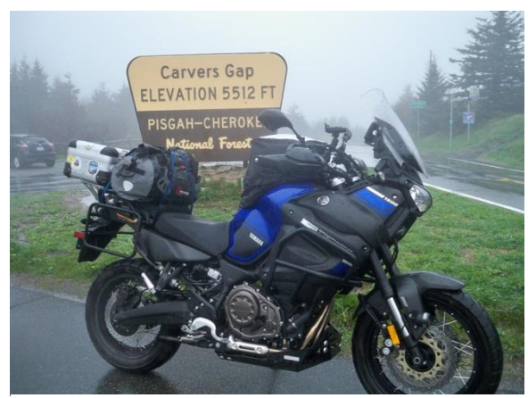
Carvers Gap where I couldn't seem to stand up. It was a really funny moment

A funny story here, one of which I don't have to tell, but will anyway. I'm in nasty weather but still decide to take the Roan Mountain route which because of the elevation becomes even nastier. It's really raining and has even become a little foggy. I park my bike for a photo in front of the Carvers Gap sign (base of Roan Mtn). As I dismount, some small rocks placed there as a landscape border cause me to trip and fall over one of the rocks. If that wasn't enough, as I get up I trip over another rock and go boom again. Please note here that I'm in full riding gear with a rain jacket, pants and helmet and thus not only look like the Michelin Man (in yellow and black) but also move somewhat