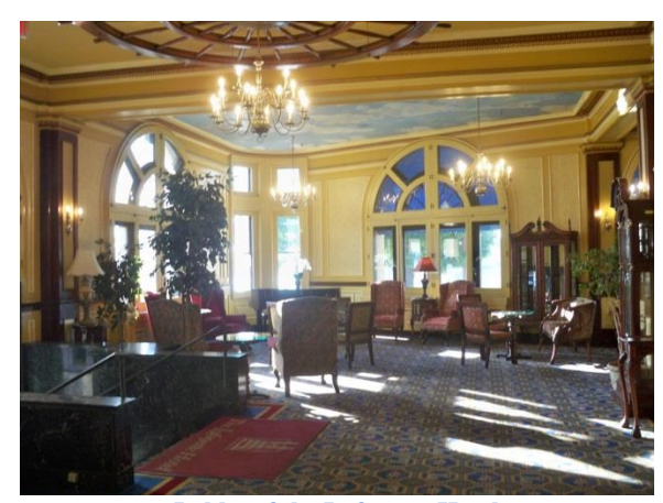
Lobby of the Lafayette Hotel

Virginia and across the Ohio River into Ohio, where I catch Hwy 7 known as the Ohio River Scenic Byway. Please allow me go back here for a minute to say that even beyond Tazewell, Hwy 16 is still full of curves as are parts of US 52; it was really good riding. The sad part here is that both of those roads take you thru some very poor areas of West Virginia where people are struggling to make ends meet as seen by their living conditions and the small towns in general. It made my heart sad and at the same time made me appreciate how lucky I am and have been in life. But now it's Hwy 7 along the Ohio River and I'm working