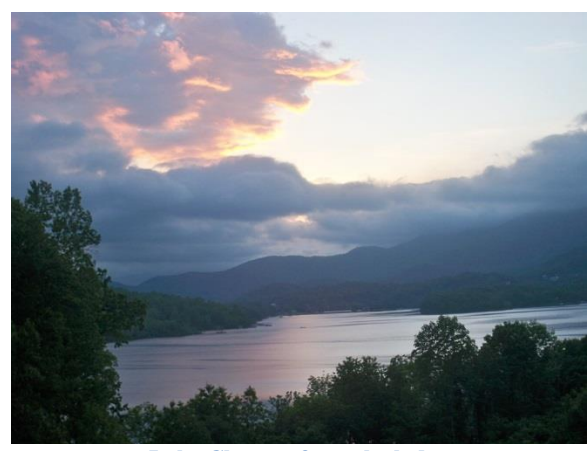
Lake Chatuge from the lodge

(Wolf Pen Gap Road) where we took a left to come back to Suches. We did the loop for a second time going further north and took Hwy 180 east. This allowed us to connect with Hwy 348 (Richard B. Russell Scenic Hwy) down to Hwy 75 and into Helen. We caught Hwy 356 on the outskirts of Helen over to Hwy 197 which took us north up to US 76 and then west into Hiawassee where we had lodging at the Lake Chatuge Lodge located on Lake Chatuge, right next to the fairgrounds and the rally headquarters. Before checking in Ken and I stopped at a restaurant just a block away from the hotel for some wings and a couple of soda pops. Climbing back on my bike, I completely