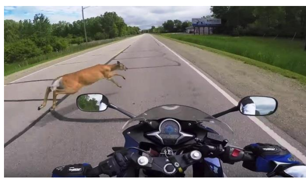
Avoid hitting a deer on your motorcycle

First off, deciding what to do about the wildlife that has suddenly appeared in lane pretty much depends on the animal. Different sizes, types and attitudes demand different responses. You don't respond to a squirrel that can't make up its mind the same way you react to the deer which appears on the road.