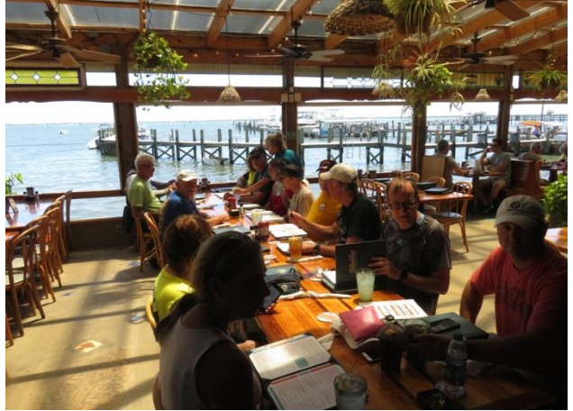
Our group at Capt. Hiram's table.

Who knew how fortuitous our plans made in December would turn out to be! And I think many riders decided to make the most of the opportunity!! We had 11 riders meet up in West Palm and meander our way along the coast and the shores of the Indian River. Perfect weather, nary a bug to be hit, and light traffic made for a great group ride!! A total 16 of us crowded into the motorcycle only parking, right at the front door, and took up our usual "table" right on the edge of the river. A superb breeze blew through the open windows. Our servers were wonderful, the food was typically tasty, and the dolphins appeared on cue for our