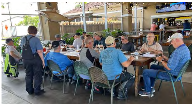
The South Lunch ride to Lightsey's Seafood had 20 riders from both coasts and parts south!