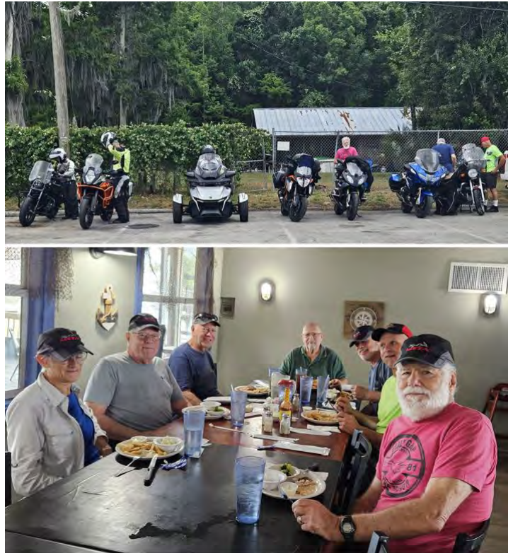
Despite the heat and thunderstorms, 7 intrepid FLMSTA riders made it to the East-Central Ride in Poinciana.

Leading off in June, we'll meet for breakfast at The Mulberry Lane Café , in North Melbourne . It's at the south end of the Rivercrest Plaza, which is on the west side of U.S.1 between Parkway Dr and Post Rd. The review summary on Google Maps is 4.7, and they got 5 stars from almost all Yelp reviewers. I've eaten breakfast there and was impressed. They also make their own bakery products and have adequate room for all of us plus plenty of paved parking. And yes, Terry, oatmeal is on the menu!