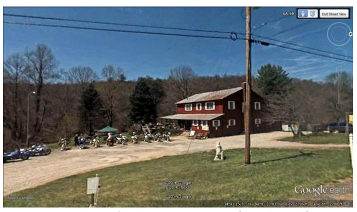
Two Wheels of Suches at GA 60 & 180