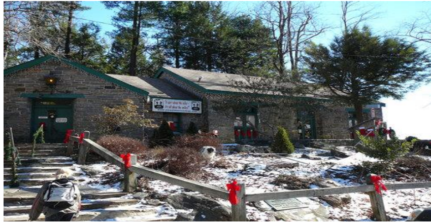
Front of Neel's Gap Store

#5, US 129 over Blood Mountain is great fun. It's steep and curvy including numerous lower gear switchbacks. Access Blood Mountain on the north end from Blairsville or from GA 180 where it intersects 129. From the south come through Dahlonega, with its gold mining history, Cleveland or Suches. Neel's Gap store sits atop the mountain and makes a nice rest stop. The Appalachian hiking trail runs right through the building.