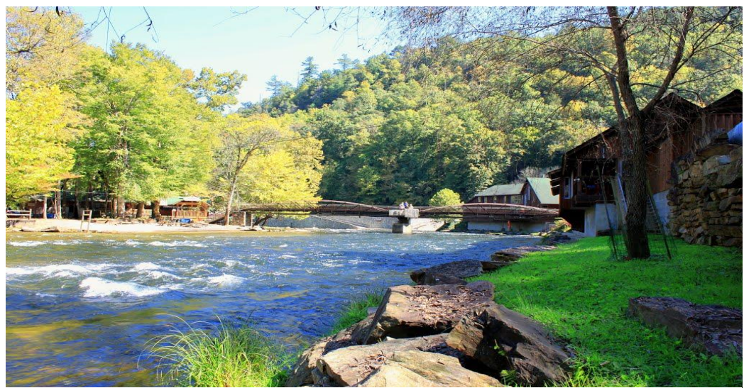
The Nantahala (River) Outdoor Center – restaurant at right, foreground

#2, The Cherohala Skyway. It runs on NC 143 west from Robbinsville, NC and TN 165 takes it into Tellico Plains, TN. This is one of the most exhilarating rides in the eastern US. Most turns allow good speed and the views can be spectacular up there.