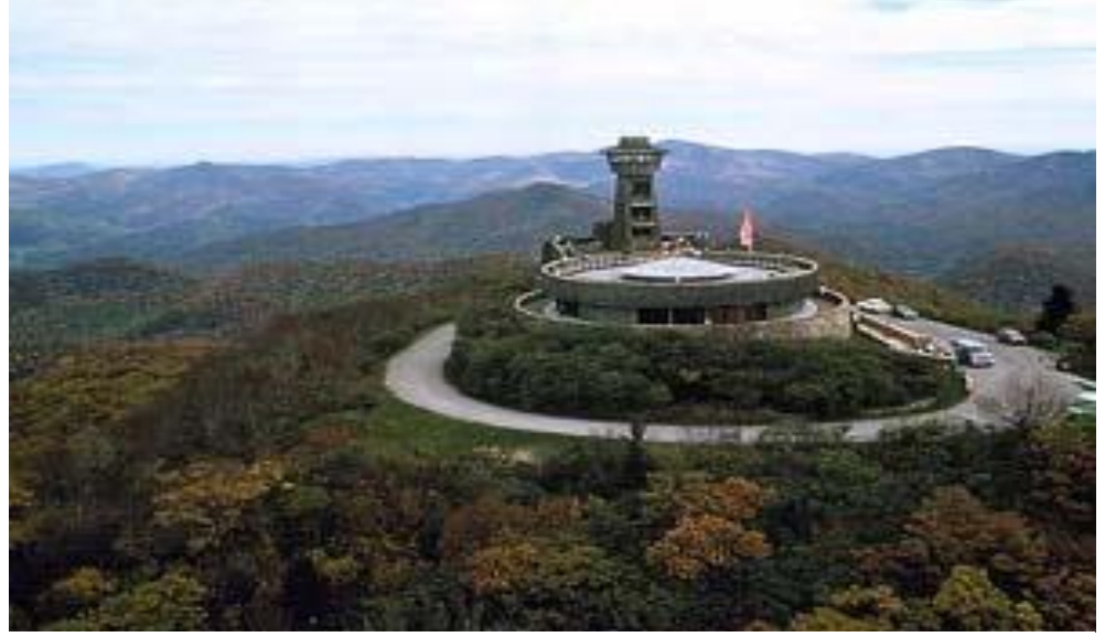
Brasstown Bald Observatory

Brasstown Bald is the highest point in Georgia and the visitor center can be accessed via the short but very steep and twisty 180 Spur. There's an observatory at the summit with great views outside and local history exhibits inside. It's said that on a clear day you can see Atlanta from up there.