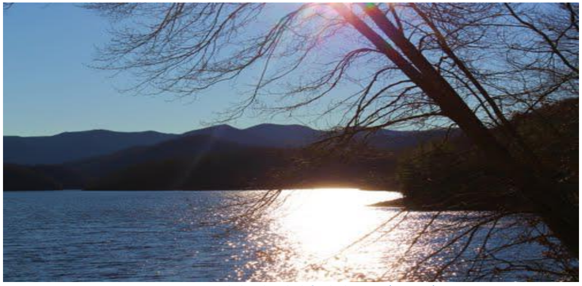
Sunset on Nantahala Lake which feeds the river