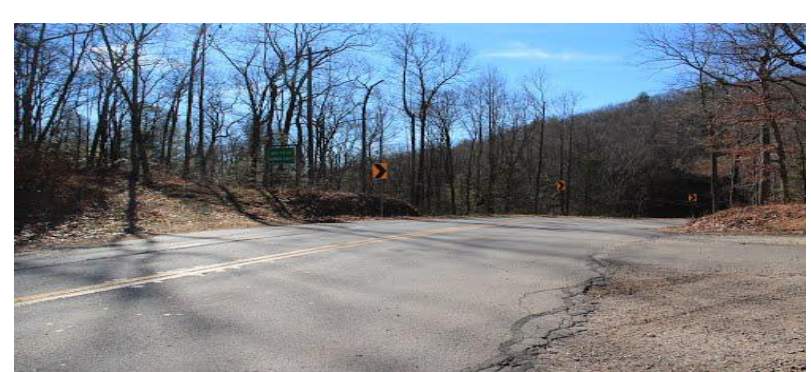
On the mountain above Vogel State Park

Brasstown Bald is the highest point in Georgia and the visitor center can be accessed via the short but very steep and twisty 180 Spur. There's an observatory at the summit with great views outside and local history exhibits inside. It's said that on a clear day you can see Atlanta from up there.