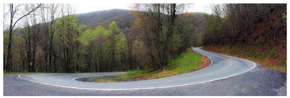
One of the many switchbacks along Wayah Rd