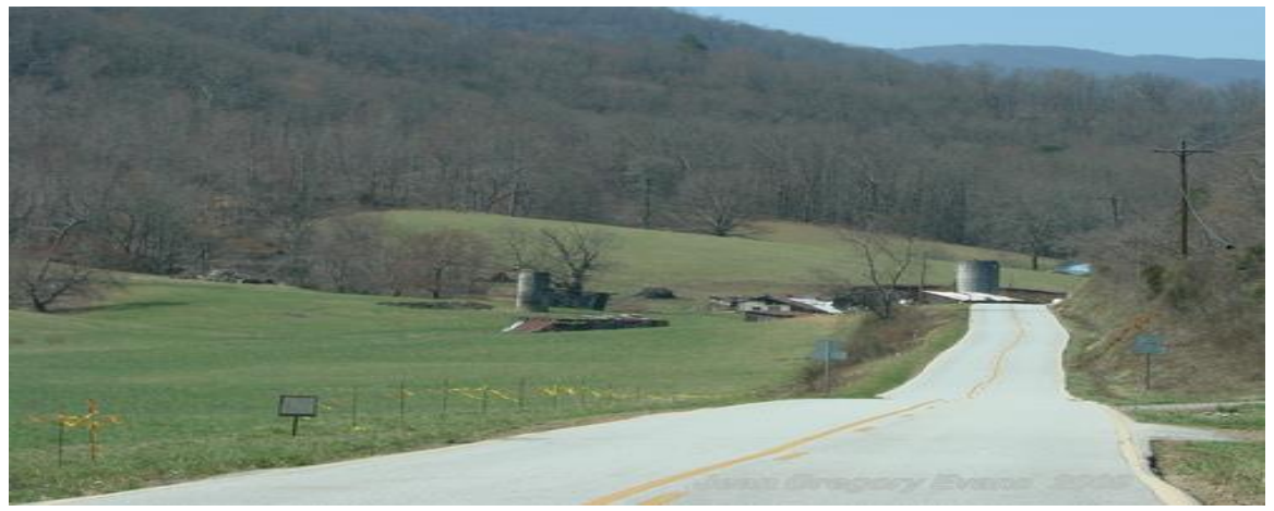
On Wayah Rd westbound before heading up the mountain (P