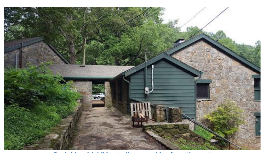
Backside with hiking trail approaching from the east