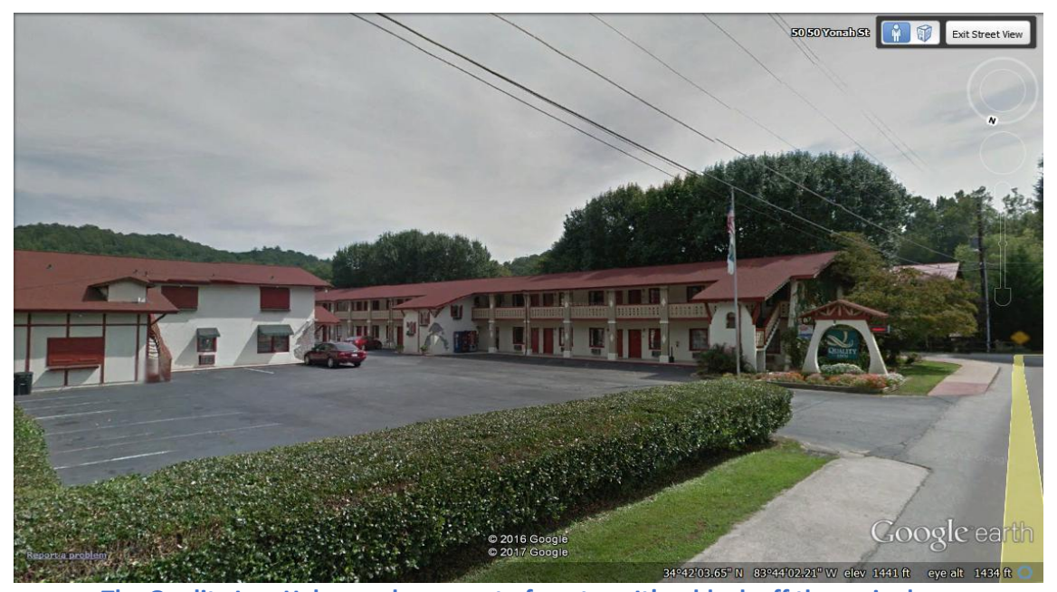
The Quality Inn, Helen... where most of us stay. It's a block off the main drag.

The Quality Inn (ph.: 706-878-2268) is once again the host hotel. Rooms are clean and comfortable. A block of them is being held at an $89/night rate until April 10<sup>th</sup>. Here's a link to the event posting with all pertinent information on the MSTA's Southeast Region website: http://msta-se.com/helen/.