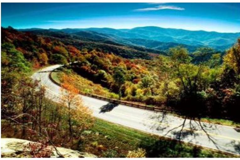
Views of the Cherohala Skyway

#3, GA 60 between Morganton and Suches and on down to US 19 below Suches. It's an experience you just don't want to miss. I love this road! It is exciting and challenging from end to end. There's one decreasing radius turn about midway that, at speed, can cause considerable puckering, especially if you're northbound.