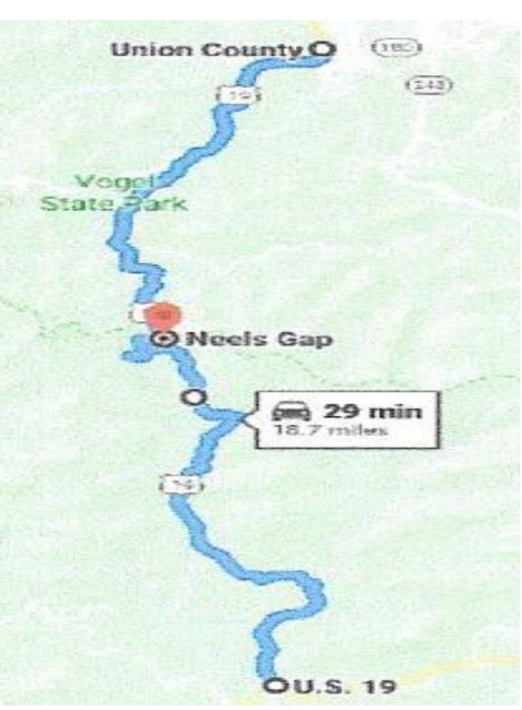
US 129 over Blood Mountain - between 180 and 60