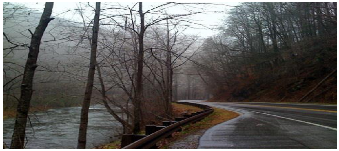
US 19/74 along the Nantahala River