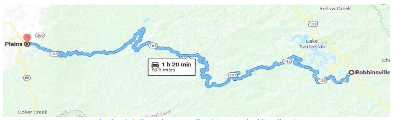
The Cherohala Skyway between Tellico Plains, TN and Robbinsville, NC

#2, The Cherohala Skyway. It runs on NC 143 west from Robbinsville, NC and TN 165 takes it into Tellico Plains, TN. This is one of the most exhilarating rides in the eastern US. Most turns allow good speed and the views can be spectacular up there.