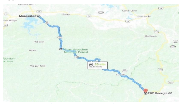
GA 60 between Morganton, Suches and US 19

Two Wheels of Suches is a motorcycle-only campground and on weekends their restaurant is open for breakfasts and lunches. They also serve diner on Fridays and Saturdays. It makes for a good rest stop even if the restaurant isn't open because there's almost always a crowd of riders there to kick tires with and furniture on the porch to relax on. There's also a convenience store/gas station across the street at the junction of 60 and 180.