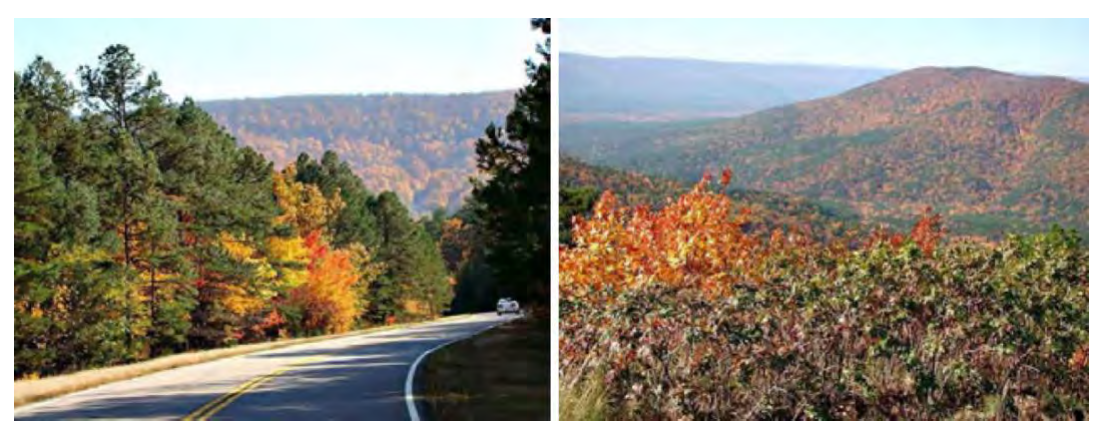
As we climbed the ridge, the colors and scenery changed and got even better!

Coming back from Talihina heading towards Broken Bow, we stopped for gas and asked the Park Ranger, who was also there getting gas, where is a good place for lunch. He says right here, at the gas station, and I say really? He says, "Yes, they have the best BBQ around." OK, so they are the only BBQ around, and yes, it was very good. The shed to the right of the bikes is the smoke shack. Smelled wonderful and tasted even better! [Note: Duncan's is located with the E-Z Mart on US-259 at Stevens Gap Road just north of SR-259A.]