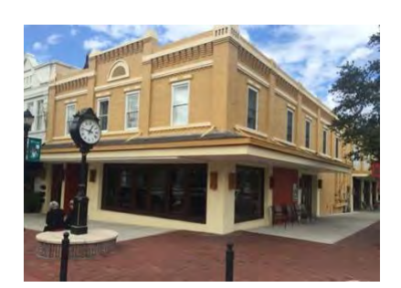
We went to Tillie's, but they had moved – only a half block away!

Two of us left Altamonte Springs at 09:45 AM on a cool, overcast morning with the possibility of rain. We had a pleasant ride on rural backroads for a 42-mile ride to Eustis. We arrived at Tillies at 10:50 AM to find two riders already