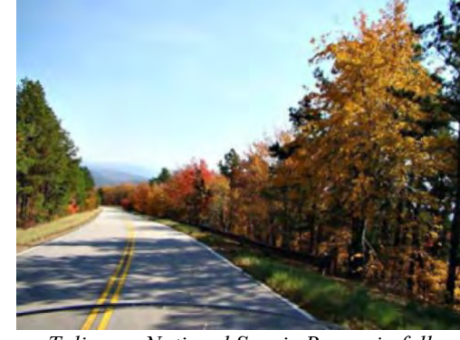
Talimena National Scenic Byway in fall

This road was designated as a National Scenic Byway in 2005 and since it runs on the top of the mountain ridge, it provides spectacular scenery along with plenty of twisties and elevation changes. This short, 54-mile stretch includes 22 scenic vista pull-outs and 13% grades – it's an amazing ride!