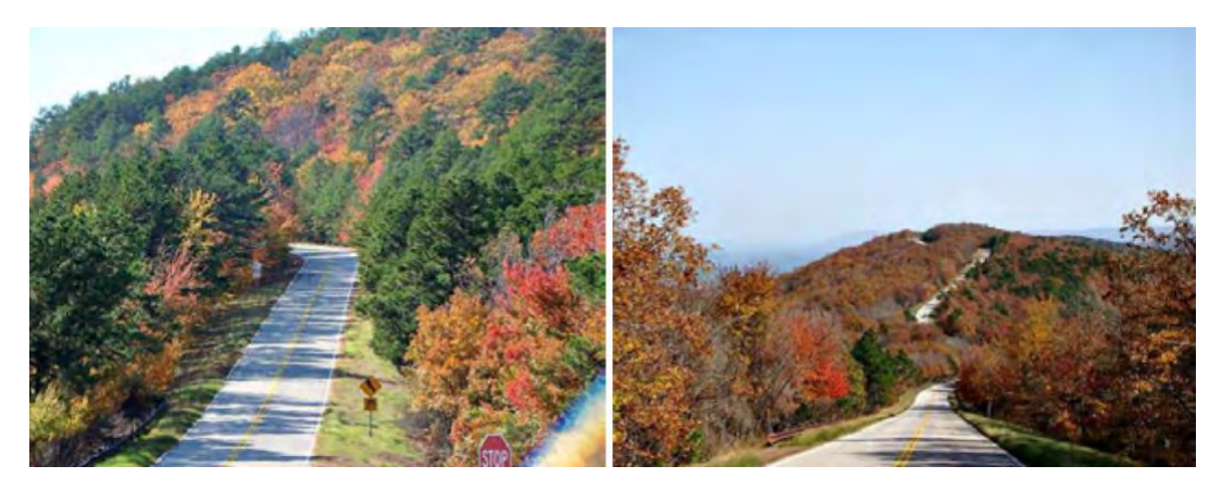
Talimena National Scenic Byway – an amazing road

After a leisurely lunch, we headed north past the <u>Beavers Bend State Park</u>. We are finally getting into the hills with lots of pine trees, but not much color yet. As we continued north, finally we hit some color as we headed towards Talihina. Just outside Talihina is where you pick up the west end of the Talimena National Scenic Byway .