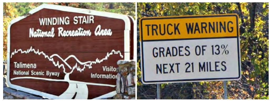
A 54-mile stretch includes 22 scenic vista pull-outs and 13% grades - an amazing ride!

We ride out of Plano and head northeast to Paris, TX. From there we took Hwy 195 towards the Red River and the Oklahoma state line. This little stretch of road is populated with some stunning farms and ranches and old growth trees covering the road as you leave Paris. It is a great ride that I wasn't expecting as we were still in the flats and couldn't even see the mountains yet.