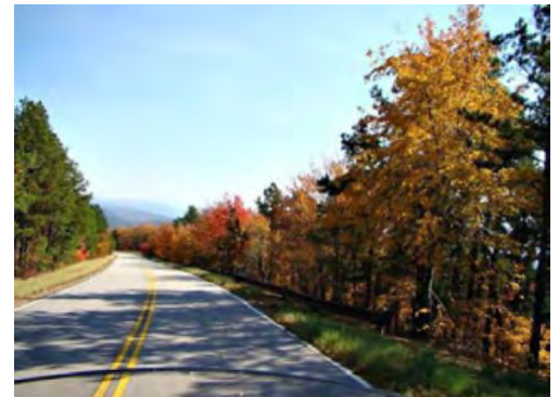
Talimena National Scenic Byway in fall

The Talimena National Scenic Byway is very unique as it runs atop the ridge of the Ouachita Mountains, which is one of the few mountain ranges in the USA that runs east-west, instead of north-south. It is approximately 54 miles long and runs between Talihina, OK and Mena, AR, hence the name Talimena. Both towns are nice but I prefer Mena so we rode north to Talihina to start the trail there and then spend the night in Mena, AR.