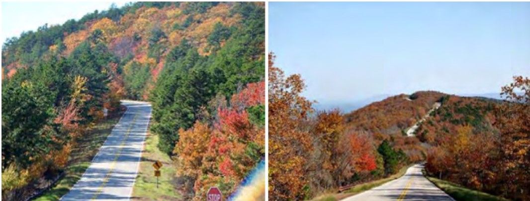
Talimena National Scenic Byway – an amazing road

After a leisurely lunch, we headed north past the Beavers Bend State Park . We are finally getting into the hills with lots of pine trees, but not much color yet. As we continued north, finally we hit some color as we headed towards Talihina. Just outside Talihina is where you pick up the west end of the Talimena National Scenic Byway .