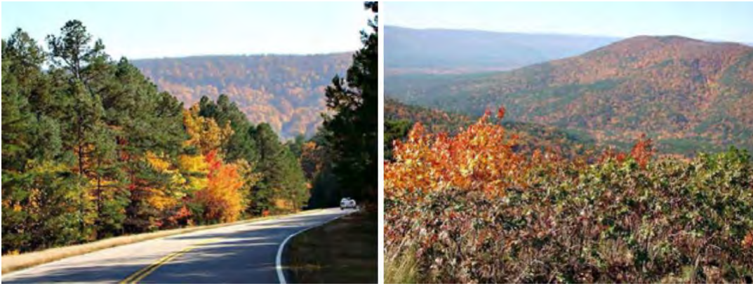
As we climbed the ridge, the colors and scenery changed and got even better!

Coming back from Talihina heading towards Broken Bow, we stopped for gas and asked the Park Ranger, who was also there getting gas, where is a good place for lunch. He says right here, at the gas station, and I say really? He says, “Yes, they have the best BBQ around.” OK, so they are the only BBQ around , and yes, it was very good. The shed to the right of the bikes is the smoke shack. Smelled wonderful and tasted even better!