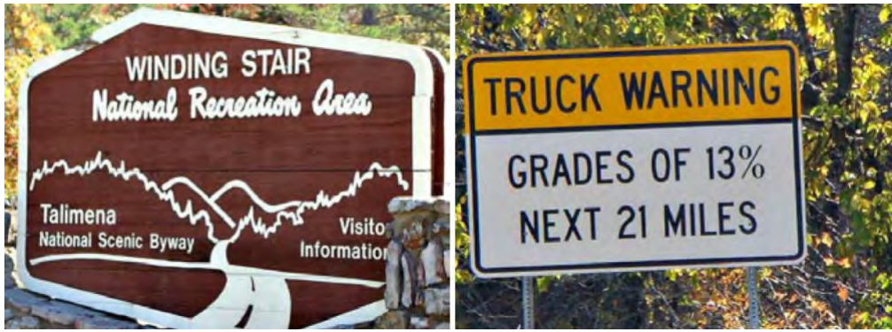
A 54-mile stretch includes 22 scenic vista pull-outs and 13% grades - an amazing ride!

We ride out of Plano and head northeast to Paris, TX. From there we took Hwy 195 towards the Red River and the Oklahoma state line. This little stretch of road is populated with some stunning farms and ranches and old growth trees covering the road as you leave Paris. It is a great ride that I wasn't expecting as we were still in the flats and couldn't even see the mountains yet.