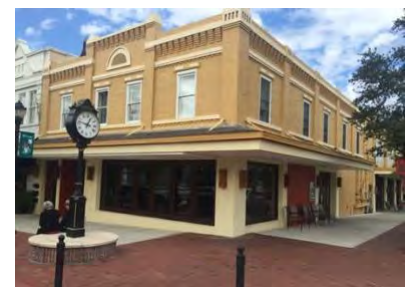
We went to Tillie's, but they had moved – only a half block away!

Two of us left Altamonte Springs at 09:45 AM on a cool, overcast morning with the possibility of rain. We had a pleasant ride on rural backroads for a 42-mile ride to Eustis. We arrived at Tillies at 10:50 AM to find two riders already there. Roy Clark and Jim Beyerl joined with us from North Florida. Larry Solomon rode the longest distance, 140 miles. Hugh rode the shortest distance, 10 miles. Altogether, we had 12 riders. Not bad for an overcast day threatening rain. I think the riders from the East Coast had hit some rain on their way to Eustis.