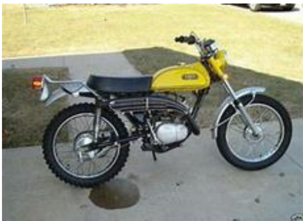
1971 Yamaha 125cc Enduro

In the early '70's, I was a civilian again and back in the Melbourne area. I bought a used '71 Yamaha 125cc Enduro. Mine looked exactly like the one pictured (below). I had an awful lot of fun with that bike. The local Yamaha dealer also sold BMW's. Back in those days, BMW was the only brand reliable enough to go long distances. And it got me to thinking about doing just that. And so, that's when I decided - SOME DAY I'm going to ride a motorcycle to MONTANA! Don't know why it had to be Montana. But that was my dream.