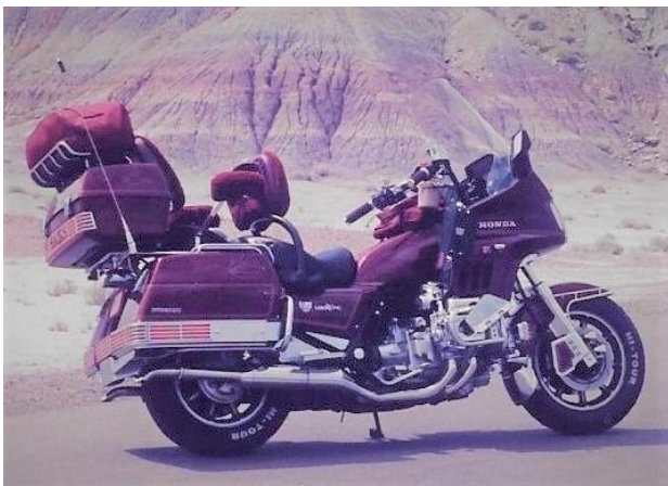
1984 GL1200 Goldwing