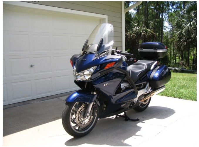
My 2004 ST1300 just before selling it in 2013

But let's jump back to 2009 for a minute. I retired at the end of July that year. On September 8 th , the day after Labor Day, I began my long-dreamed-of journey to the northwest. Over the course of the next 32 days, I would ride in 26 states, including MONTANA, and put on over 10,000 miles. Mission MONTANA accomplished! The ST was rock solid throughout.