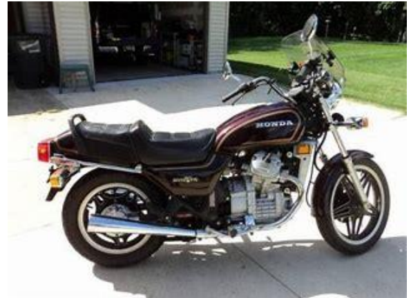
1981 500cc Honda Silverwing

I found a low mileage 1981 500cc Honda Silverwing in good shape and bought it. The one pictured (right) is the same color and configuration as the one I had except that I put a small aftermarket faring on mine. My intention, of course, was to eventually ride it to Montana.