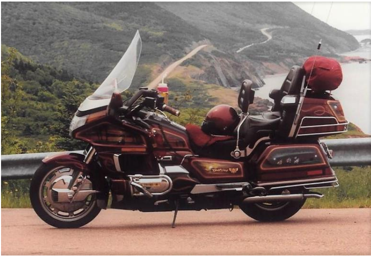
My 1989 GL1500 on the Cabot Trail – note the airbrushed murals

Finally, in 2004, on the way home from Americade in New York, I traded the '03 Wing for an '04 ST1300 with 5k miles on it. It was a keeper. A throttle lock, Sargent saddle and Givi trunk gave it everything I needed for comfortable long-distance travel. I put 90k more trouble-free miles on it and kept it until 2013. That's it (below, right) when I got it ready to sell.