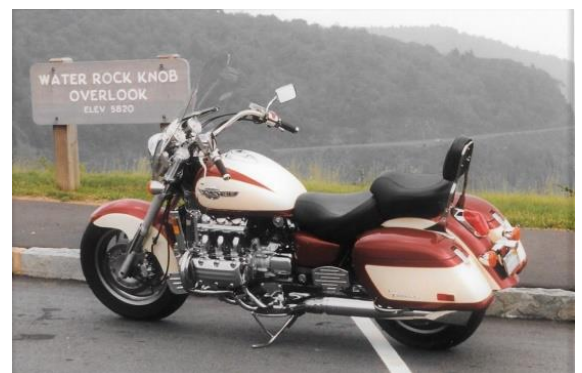
1998 Valkarie Tourer

Then came a '98 Valkarie Tourer which, though powerful enough to do power drifts, didn't have enough ground clearance for aggressive cornering in the mountains. My '03 Yamaha FJR buzzed at or above 70 mph. And an '03 GL1800 Wing had persistent saddlebag latching issues.