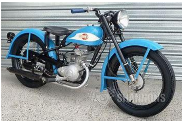
1958 Harley Davidson 125cc Hummer

My own journey started during my early 1960's high school years in Melbourne, Florida. I talked my dad into helping me buy a used '58 Harley Davidson 125cc Hummer (against my mother's better judgement). What a piece of crap it turned out to be. But it got me to school. And it got me to my part-time evening job at the local Dairy Queen. It even got me to the Saturday night car races at the speedway west of town - and other pleasures, too. Except for the all too frequent engine-rebuild parts, it was cheap to operate. But 40 mph was about all it could muster without hitching a draft behind a school bus. I think it only put out around 5 hp.