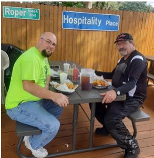
Oct Central Ride at Lake Harris Hideaway in Tavares

On our home front, we continue to be healthy and utilize as many guidelines as possible. The life we save may be yours... We sincerely hope that all of you have marked off another month of good health for yourselves and those near and dear to you.