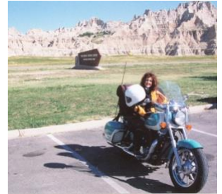
Our first big trip out West Badlands National Park-SD

Over the years we became more confident with our touring knowledge and skills, so in 2001 we did our first truly big trip out West. We were on the road for 21 days, covered over 8,000 miles and visited 18 states. This was a wonderful trip! Dianne was riding a Honda 1100 Ace Tourer, and I was on a Yamaha Venture. While both bikes qualified as “touring” bikes, we discovered that our fuel range (at around 150 miles) was somewhat restrictive in certain areas of the West. We never ran out of gas, but it was certainly close on a few occasions.