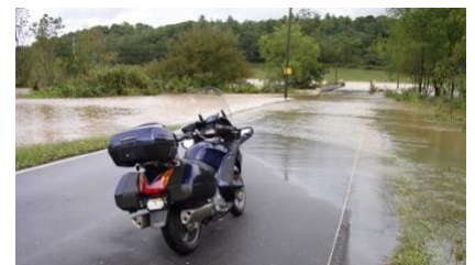
Chasing and being chased by 3 hurricanes in one trip – Dang!

Mother Nature made our 2004 trip to Northeast Georgia and Western North Carolina to be perhaps our most challenging. Our plans were to leave home on Labor Day weekend. However, approaching Hurricane Francis had other ideas. With evacuations in progress, we knew just to get out of the state getting gas would be difficult and time consuming, not to mention securing a hotel room at the end of the day. So we elected to delay our start date and ride the hurricane out at home.