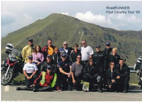
Our European tour group – 4 countries in 10 days on BMW motorcycles – a must for the bucket list!