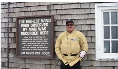
We discovered why New England mountains are green – all the rain!

2003 was a notable year for our 2-wheel travels. We toured the New England states, which included a 2-day stop in Lake George, New York , for the Americade rally. We have since been back to this area because of its fantastic riding and gorgeous scenery. This being our first venture into the area we discovered why their mountains are green. We had eleven days of rain! Our investment in good rain gear and touring bikes with hard bags aided in our travels enormously! Regardless of the rain, we had a wonderful time. Little did we know that future travels would expose us to even more difficult conditions that Mother Nature would throw at us.