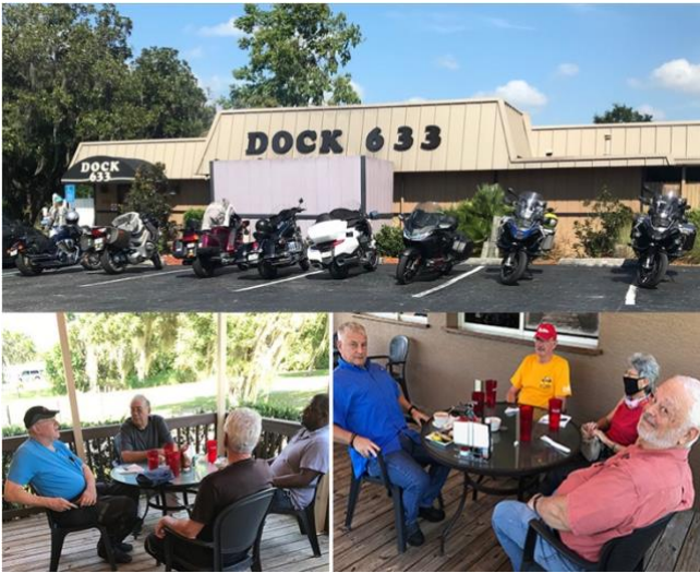
Oct South Ride (l-r):