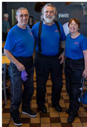
Food was outstanding at the Staghorn Kitchen in Clewiston for the South Ride