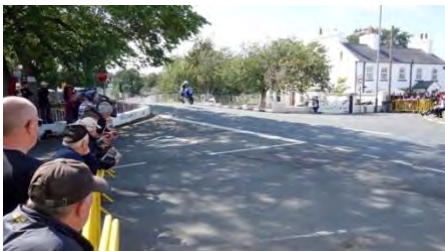
Defying gravity at Ballaugh Bridge

From the Douglas ferry terminal, we caught a city bus to our hotel. After check-in, we hurried off to the nearest pub for a bite and a pint of Okell’s, the local brew. Lots of fans choose to pitch tents for the duration, but that choice is for the young. There is also “glamping”, offered by a couple vendors, which is an improved experience, including raised platforms and good bedding in yurt-style tents. Still, crowds, noise and shared baths were not desirable to our brides. Instead, we found our way to the Best Western Hotel & Casino in Douglas on the Queens Promenade. Their amenities were equivalent to a Quality Inn in the U.S. The hotel could use a face lift, but it is ocean-front, comfortable, quiet and convenient to the Noble Park grandstands.