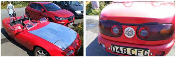
Miata MX3 – but why?!

As we travelled around, we came across a most unusual vehicle, a boat-tailed 3-wheeler Miata! We never got to speak with the proud owner, but I snapped a couple photos.