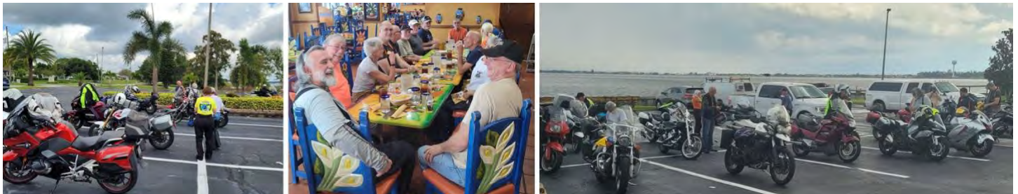
Great turnout for the Central Lunch Ride at Don Jose's in Sebring – even with the rain!