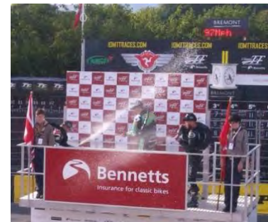
Liquid revenge on McGuinness!

Both racing and practice sessions are scheduled after workday hours on weekdays. Thus, there is plenty of time to explore the course and the rest of the island in between them. You can completely circumnavigate the island in about three hours, even touching the extreme points. We rented a Hyundai Santa Fe from www.oceanford.com . In my opinion, a slimmer car would have been preferred as we bounced amongst typically narrow British hedgerows. Motoring anxiously on the wrong side, it's easy to scrape paint from a shiny new side panel, so a wise driver will spring for full insurance coverage.