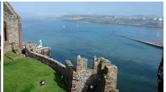
(L-R) Racers visit the Fairy Bridge to request safety and good fortune. Classic Triumphs at rest in the beautiful, quaint village of Cregneash. The town of Peel and its castle are worth some time!