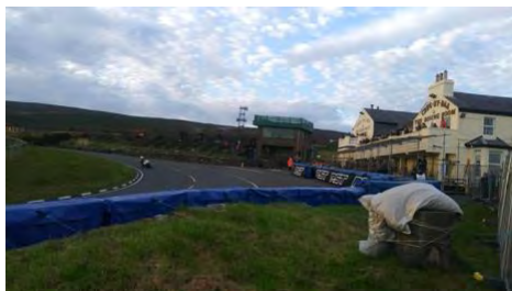
The Craig-Ny-Baa corner. Note the spectators on the balcony.

Our third spot was the pub at Creg-Ny-Baa, which is situated at the apex of an “ell”. Riders approach on a 1/2-mile straight, round the corner, and depart on a one-mile straight. Wheee! The Creg was fairly packed, but we were served an excellent fish and chips dinner, with Okell's, in record time.