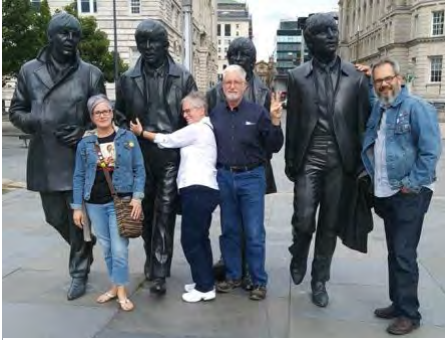
...then she left me for George – right in front of her sister!

Liverpool is a fun and interesting city – a great place to overcome jet lag before setting out for the Isle Of Man. Besides Beatles mania, there are many more serious sites, such as the Liverpool Cathedral, the second largest in the world, after St. Peter’s in the Vatican. Also, the waterfront played a critical part in shipbuilding during WWII.