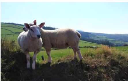
Down a narrow road which we had to share with disgruntled locals

The Isle Of Man reminded us of Ireland – rolling pastures of grazing sheep, craggy coastline, changing sky. As are all of the British Isles, travel by motorcycle is the oyster's ice skates! As stated earlier, driving a six-foot-wide car down a squiggly, rock-walled, 7-foot-wide road - shared with oncoming traffic – is taxing to one's nervous system. If you can get your hands on a bike, motorcycling is an improved way to travel. But now I'm preaching to the choir!