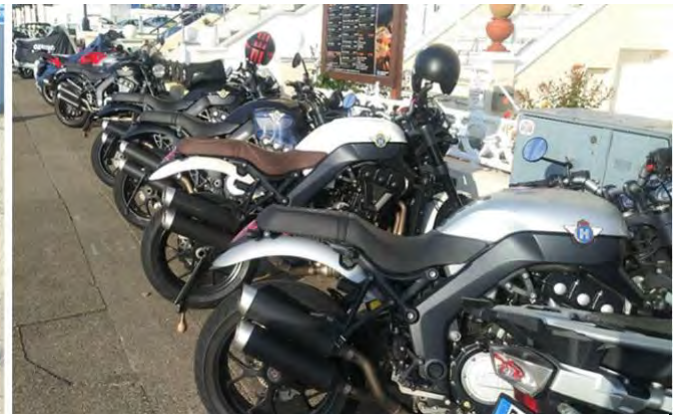
Heavy metal with a heavy price! Horex's to your heart's desire, right here.

We budgeted four days to enjoy motorcycles, racing and the IOM culture. In that time, we were able to view the course from three prized vantage points, including the Grandstands, Ballaugh Bridge and Creg-Ny-Baa. At the Grandstands you can watch the starts and some speedy passes.