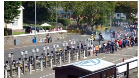
One of a series of timed launches

At Ballaugh Bridge you can watch the riders get airborne as they leap over. The preferred vantage point here is from The Raven pub, where you can get food and drink as you watch. Before practice on Friday, a local ambulance zipped by and caught more air than any of the racers. Clearly, he was just hotdogging it for the crowd, but yeah – it was pretty cool!