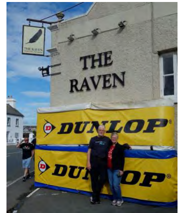
In between TT races at a prized vantage point – The Raven pub at Ballaugh

Many months passed before I set out again to build the trip. This time the pieces clicked! We decided to dip our toe into the TT experience by going to the Classic TT in August, rather than the main TT in May. As a bonus, the Manx Grand Prix, operated since 1923, is held at the same time on the same course. Our goal was to take in all that we possibly could of the TT experience, while avoiding the crazy mobs, high cost, congestion and transport issues that come with the May event. My order of bookings was as follows: