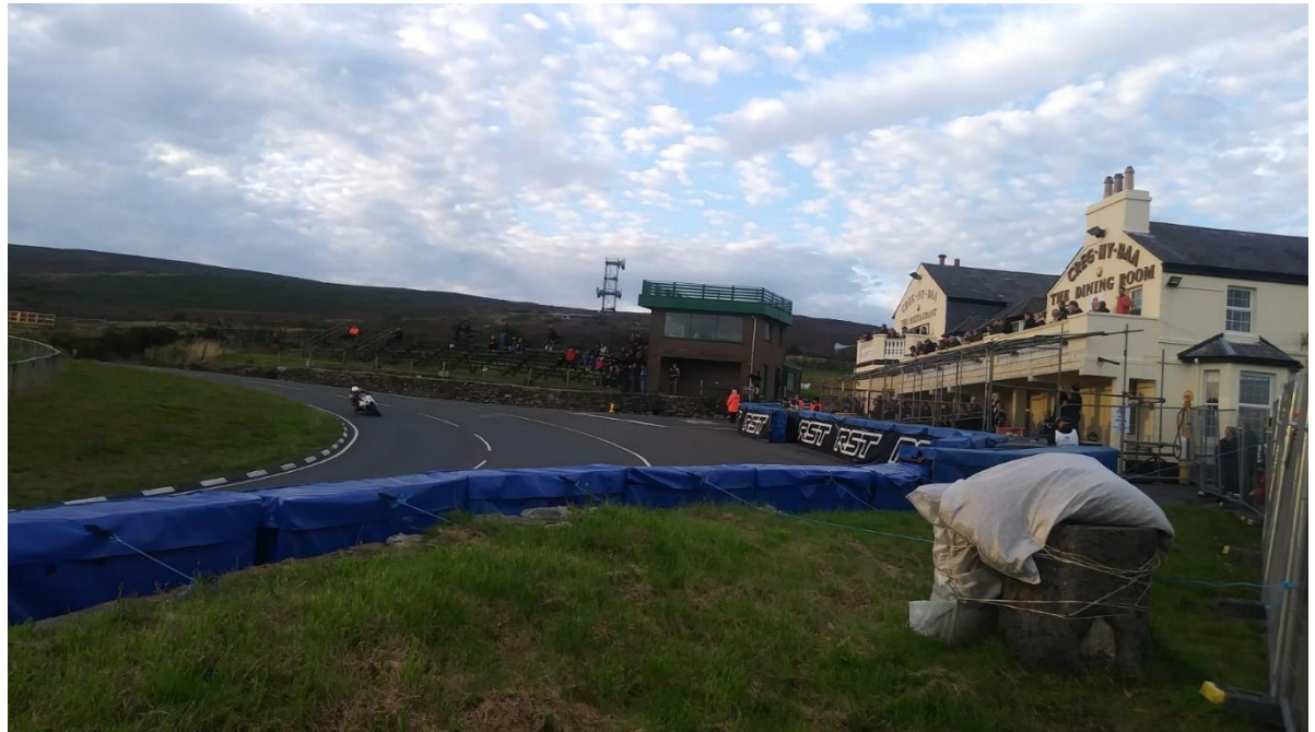
The Creg-Ny-Baa corner. Note the spectators on the balcony.

Our third spot was the pub at Creg-Ny-Baa, which is situated at the apex of an "ell". Riders approach on a <sup>1</sup>/<sub>2</sub>mile straight, round the corner, and depart on a one-mile straight. Wheee! The Creg was fairly packed, but we were served an excellent fish and chips dinner, with Okell's, in record time.