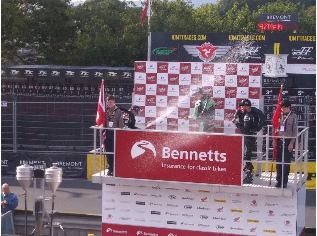
Liquid revenge on McGuinness!

Both racing and practice sessions are scheduled after workday hours on weekdays. Thus, there is plenty of time to explore the course and the rest of the island in between them. You can completely circumnavigate the island in about three hours, even touching the extreme points.