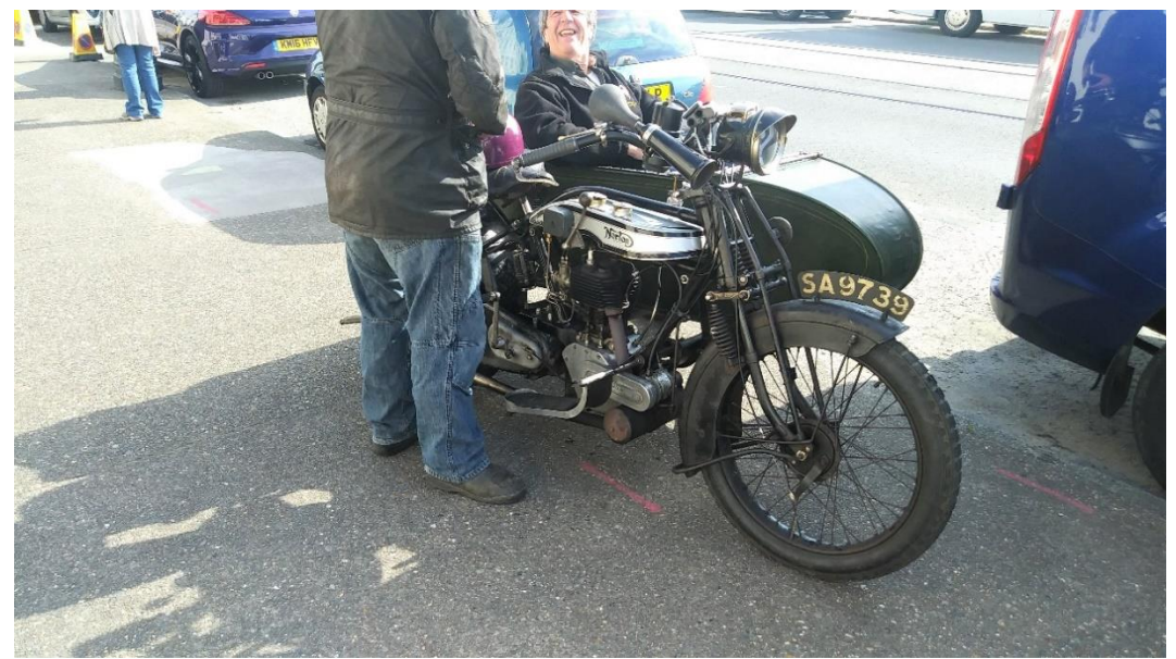
These happy Nortoneers were seen putting about town!