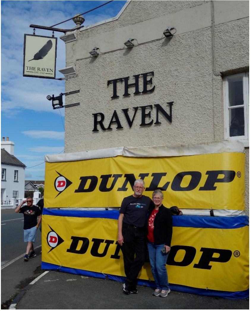
Anticipating the next race at The Raven pub by Ballaugh Bridge