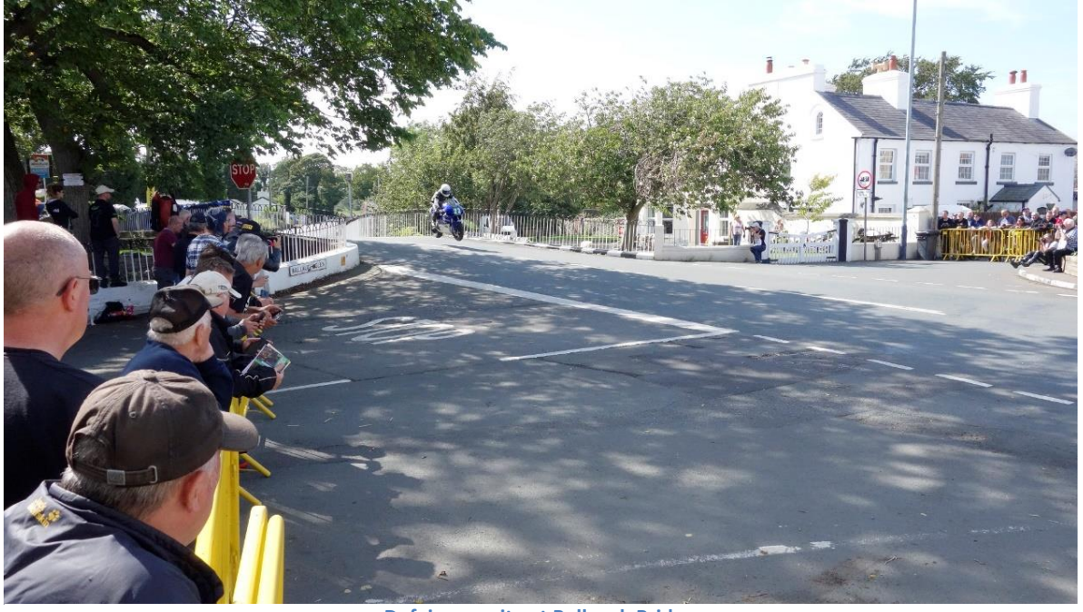
Defying gravity at Ballaugh Bridge