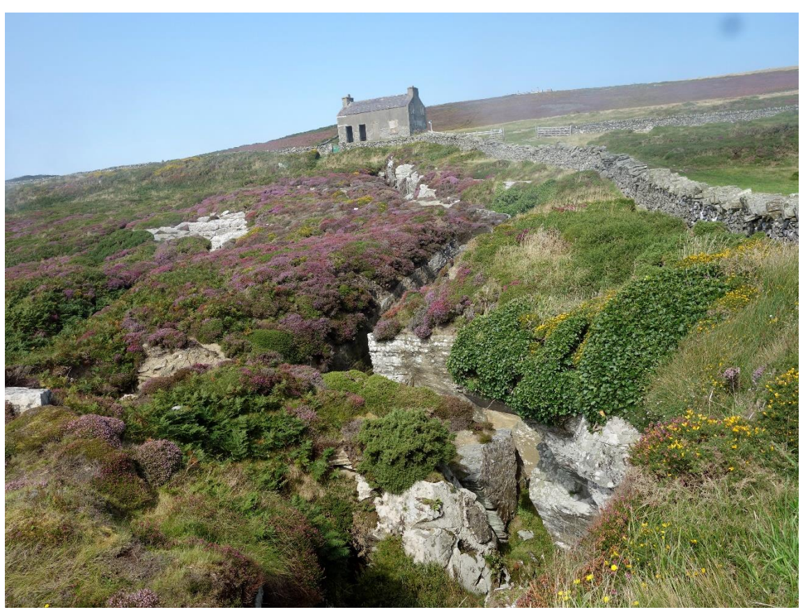
The Chasms, over the hill from Cregneash. Watch your step! The purple heather was stunning!