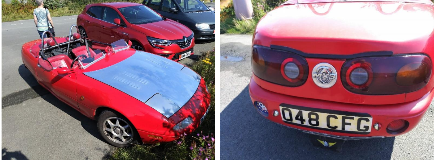
Miata MX3 – but why?!

As we travelled around, we came across a most unusual vehicle, a boat-tailed three-wheeler Miata! We never got to speak with the proud owner, but I snapped a couple photos.