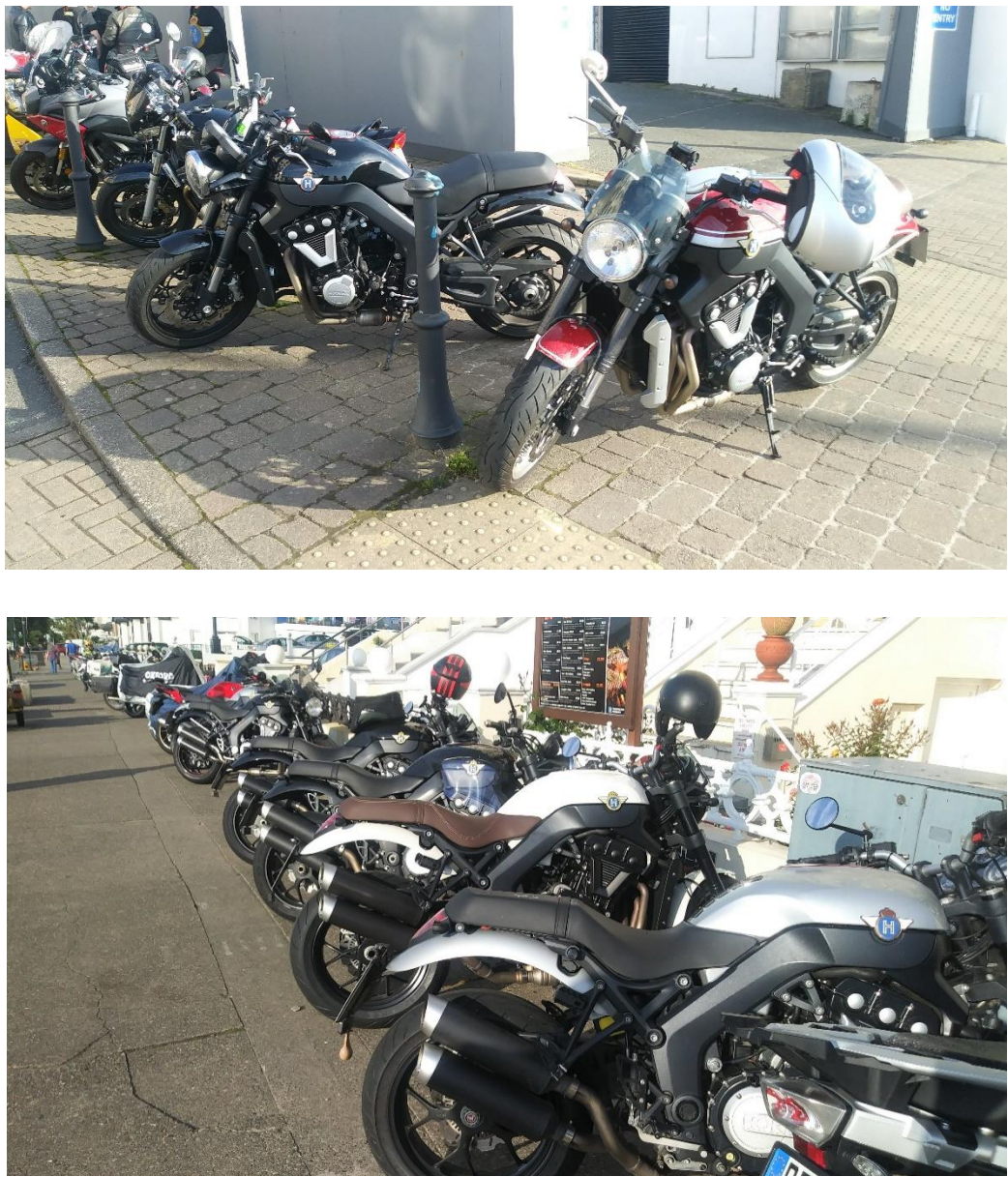
Heavy metal with a heavy price! Horex's to your heart's desire, right here.

We budgeted four days to enjoy motorcycles, racing and the IOM culture. In that time, we were able to view the course from three prized vantage points, including the Grandstands, Ballaugh Bridge and Creg-Ny-Baa. At the Grandstands you can watch the starts and some speedy passes.