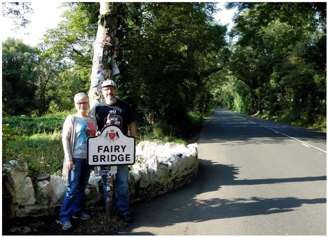
Racers visit the Fairy Bridge to request safety and good fortune