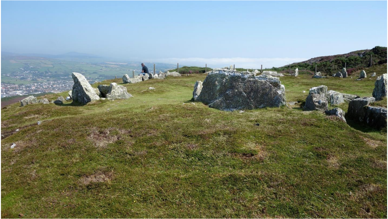
Meayll Circle on Mull Hill – what a view!