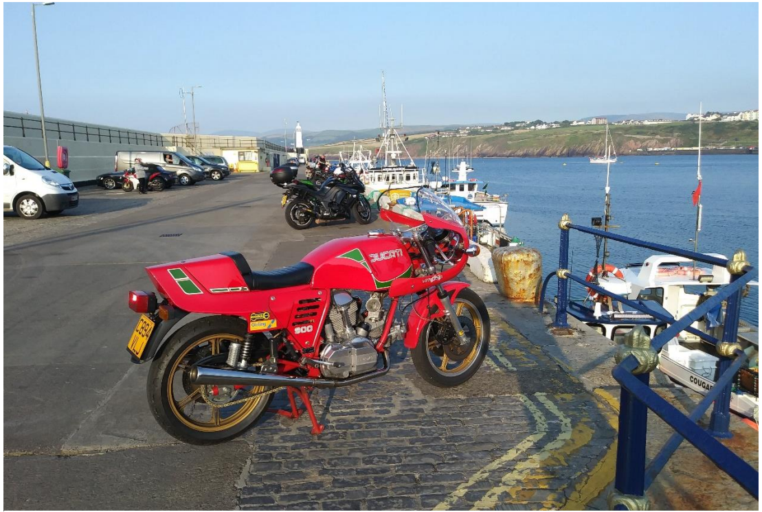
A splendid Duc at the Peel Castle pier. Don't forget the legendary ice cream here at Davison's!