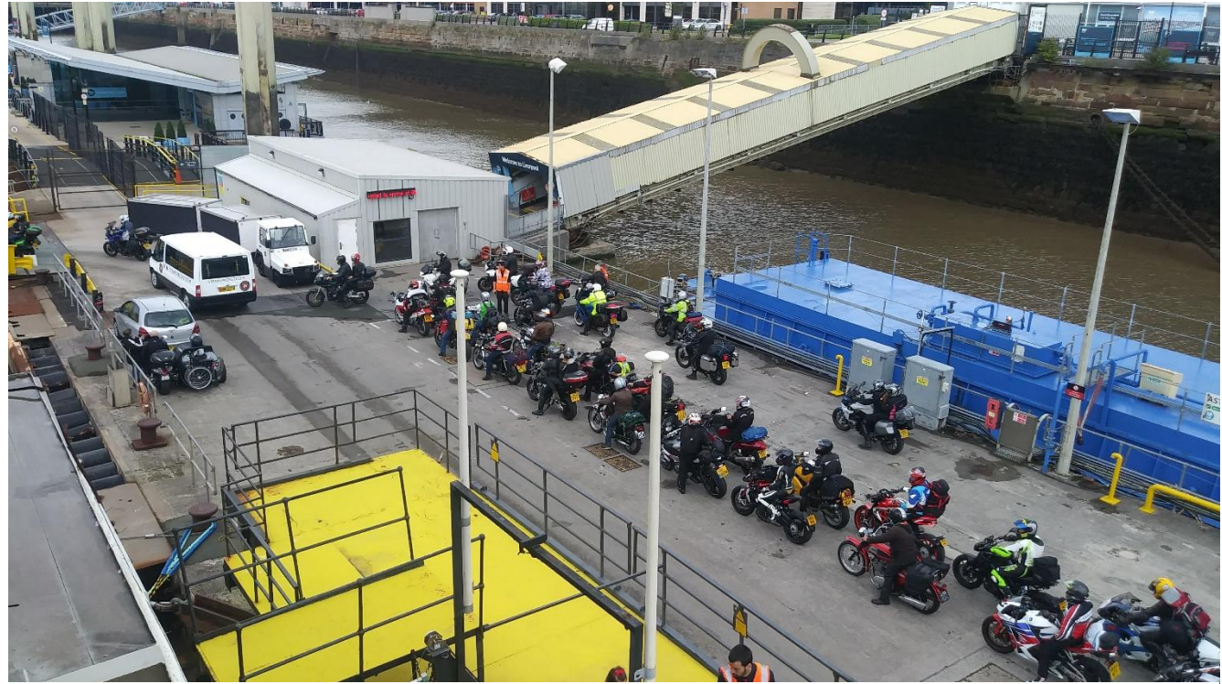
Loading onto the Steam Packet ferry

From the Douglas ferry terminal, we caught a city bus to our hotel. After check-in, we hurried off to the nearest pub for a bite and a pint of Okell's, the local brew. Lots of fans choose to pitch tents for the duration, but that choice is for the young. There is also "glamping", offered by a couple vendors, which is an improved experience, including raised platforms and good bedding in yurt-style tents. Still, crowds, noise and shared baths were not desirable to our brides. Instead, we found our way to the Best Western Hotel & Casino in Douglas on the Queens Promenade. Their amenities were equivalent to a Quality Inn in the U.S. The hotel could use a face lift, but it is ocean-front, comfortable, quiet and convenient to the Noble Park grandstands. Visit www.iomtt.com, www.isleofman.com and www.visitisleofman.com for some useful resources.