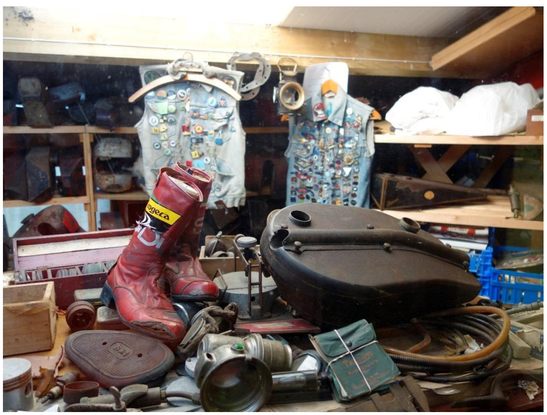
This still life caught my eye at Murray's.