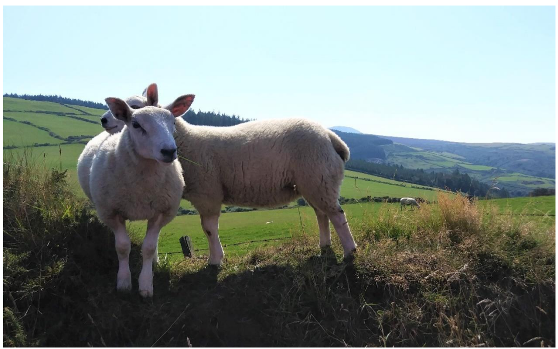
My phone GPS took us down a narrow road, which we had to share with disgruntled locals.

The Isle Of Man reminded us of Ireland – rolling pastures of grazing sheep, craggy coastline, changing sky. As are all of the British Isles, travel by motorcycle is the oyster's ice skates! As stated earlier, driving a six-foot-wide car down a squiggly, rock walled seven-foot road - shared with oncoming traffic – is taxing to one's nervous system. If you can get your hands on a bike, motorcycling is an improved way to travel. But now I'm preaching to the choir!