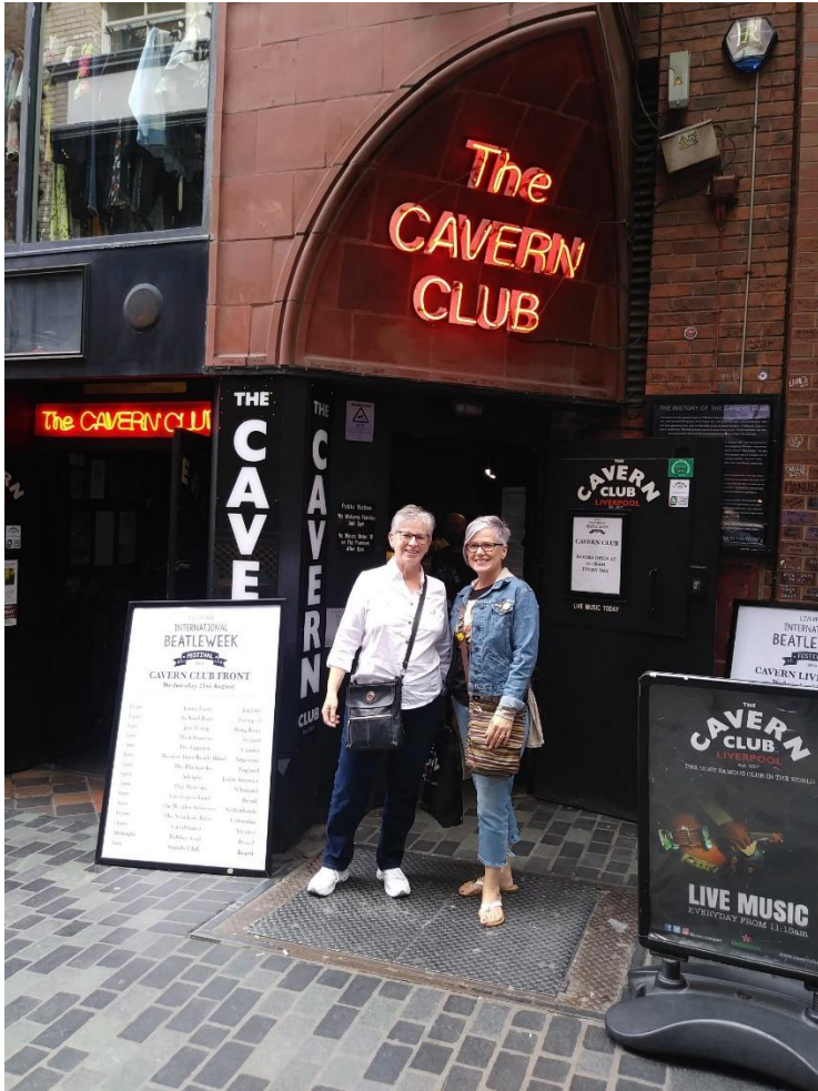
Our girls beaming at the Cavern Club with the Beatles Week band lineup

Liverpool is a fun and interesting city – a great place to overcome jet lag before setting out for the Isle Of Man. Besides Beatles mania, there are many more serious sites, such as the Liverpool Cathedral, the second largest such in the world, after St. Peter's in the Vatican. Also, the waterfront played a critical part in shipbuilding during WW2.