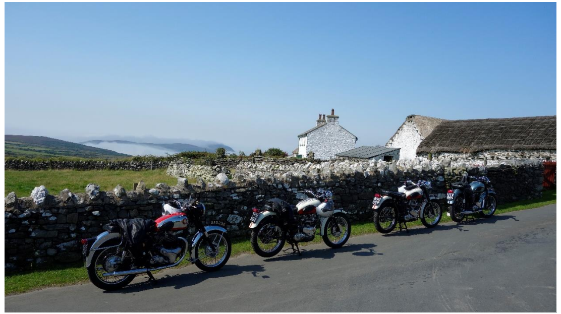
Classic Triumphs at rest in the beautiful, quaint village of Cregneash