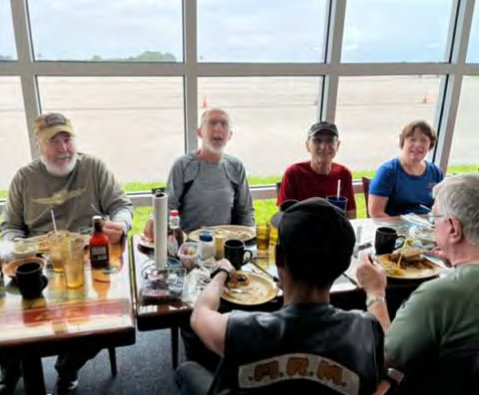
Final South Brunch ride at the Landing Strip in Okeechobee was a winner!