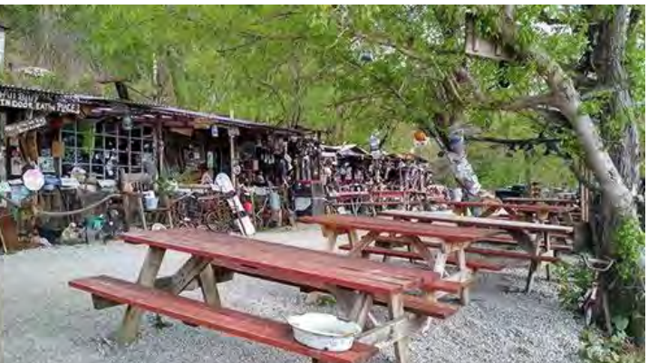
Hillbilly Hotdogs in Lesage, WV – Ummmm good!