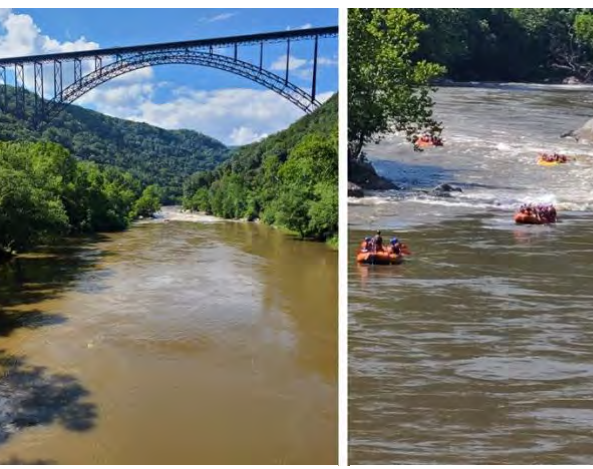
New River Gorge Bridge Fayetteville, WV

Tuesday, we did the "02 - Bridge Ride 315" (map). This tour bike friendly route squiggled southeast through the mountains then way south to lunch at Pies & Pints in Fayetteville, WV, which is near Beckley. Then we rode across the New River Gorge Bridge just east of town. The view was spectacular. A narrow, 7.5-mile road zig-zagged down below the bridge and along the water where rafters were enjoying their float downriver. And down there, we were absolutely awestruck with the massiveness and height of the bridge as well as the depth and width of the gorge Just how on earth did they ever construct that bridge? At 315 miles, it was the longest ride offered, and we may have shaved a little off by letting our GPS's find the fastest way back to the hotel.