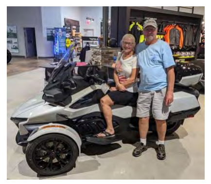
Rachel, the Arachnid, our 3-wheel 2021 CanAm Spyder

Three years ago, when Black Beauty was nearly ten years old, we began the talk about our next motorcycle. We keep things forever...and when we purchased Black Beauty in 2009, we thought she would be our forever motorcycle. But our riding style and maturity, as well as Black Beauty's maneuverability, caused us to begin thinking differently.