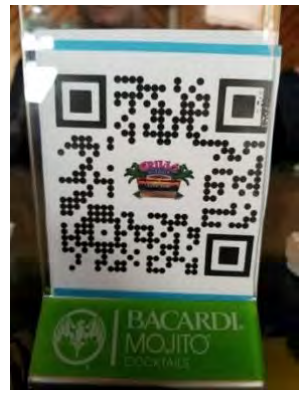
This is the menu. You capture this with your smart phone camera, and it downloads the menu to your phone. Pretty cool.

The ride back home was considerably warmer, but not unbearable. It was a fine way to spend an August morning!