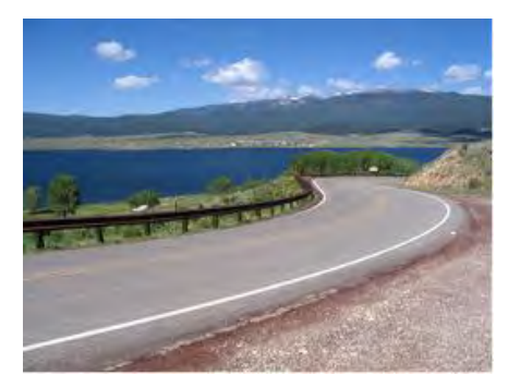
Approaching Eagles Nest, NM between Raton Pass and Taos.

On US 87 heading toward Raton Pass, New Mexico late that afternoon, the sky directly ahead was black, layered and roiling. It looked alive, menacing and evilly foreboding. And then as I dreaded the worst, the highway would veer left or right toward daylight. This happened several times. But as I neared Raton, I knew that my luck had run out. I checked into a hotel. It started to rain lightly as I unpacked and covered the bike. By the time I got to my 2nd floor room, it turned into a gully-washer. That was a close call. Severe hailstorms were reported east of Raton that night. I was thankful for my good fortune.