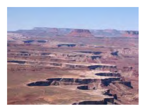
Green River overlook in Canyonlands NP, Utah

Over in Utah, I still wanted to see several of the parks that I missed in 2009. Southwest of Moab lays the widely spread out Canyonlands National Park. In it, among many other interesting sights, the Green River, originating in the Wind River Mountains of western Wyoming, winds its way quite dramatically through the park's deep ravines. Smaller by comparison, the Colorado River also winds through the park from a more northeasterly direction and joins the Green. The combined river is then called – no, the Colorado? One would think the larger river would dictate the combined name. Turns out, the Colorado River was known as the Grand River prior to 1921. Thanks to a U.S. House Joint Resolution proposed by a Colorado representative that year, the Grand and the combined river were renamed the Colorado.