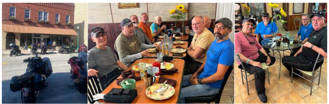
Lots of gab and good cheer at Myshelly's in Arcadia

We ended up at two tables. Lots of gab and good cheer for most of the morning. The smaller table enjoyed a typical meal and service. In fact, they were able to leave for home before our meals even arrived. Our 11-meal order was mishandled. One of our members had to leave before eating, after riding 90 minutes to join us. And like last year, there were additional issues with the checks and recording of payments. To summarize our experience, and be polite in a few words, the training of her staff is inadequate. It's a shame really, as the facility and food are quite good. With a later than expected departure time, most of us made our own way home. I soloed a direct route home to honor an appointment, while four Southies made their way along the Venus bypass and likely enjoyed an ice cream stop in Clewiston...!