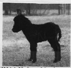
HHAA Unique Monique 2

The American Donkey and Mule Society, PO Box 1210, Lewisville TX 75067 www.lovelongears.com/ (972) 219-0781 The American Donkey and Mule Society is not responsible for errors in information submitted to the registry.