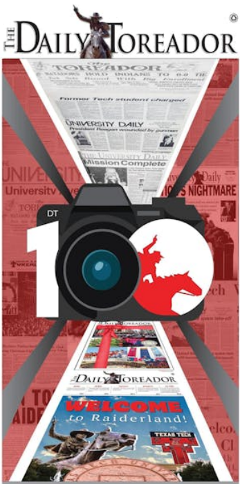
Print Edition Archive

Up next, the Red Raiders will embark on a six-game road trip starting with a single game against Abilene Christian University at 6:05 p.m. on Tuesday in Abilene.