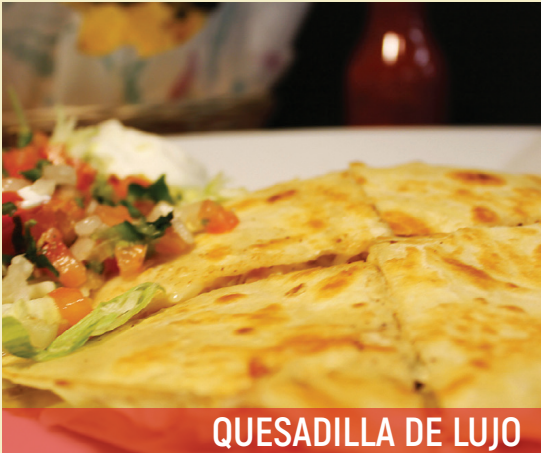
QUESADILLA DE LUJO