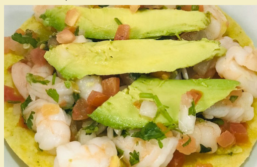
TOSTADA DE CEVICHE