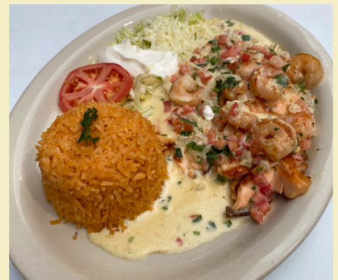
CANCUN SALMON & SHRIMP