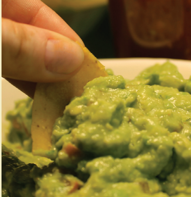
FRESH GUACAMOLE DIP