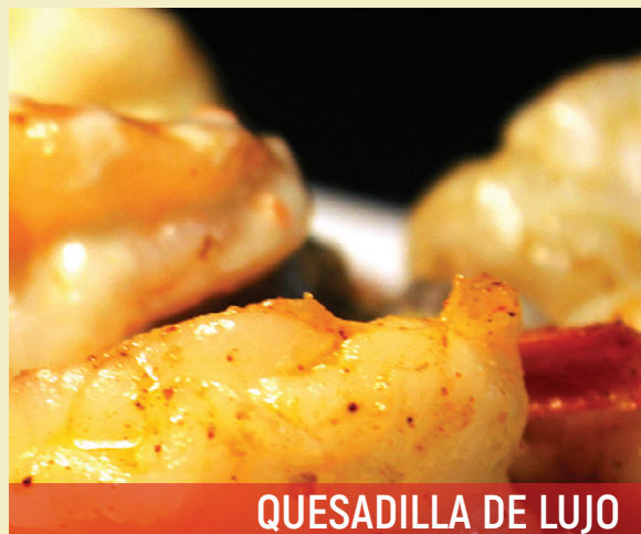
QUESADILLA DE LUJO