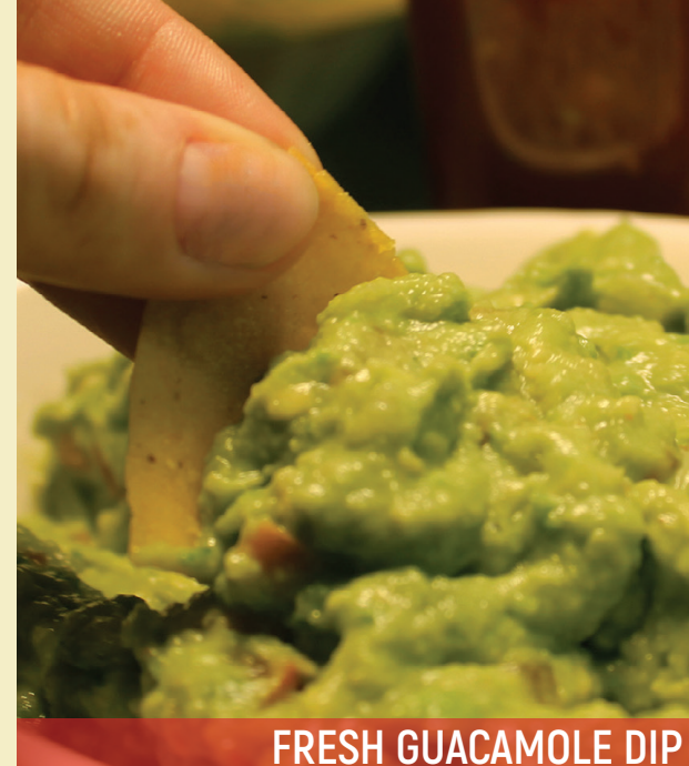
FRESH GUACAMOLE DIP