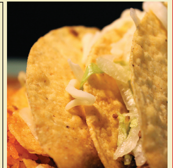
HARD SHELL BEEF TACOS

3 enchiladas filled with grilled veggies and topped with cheese sauce. Served with rice.