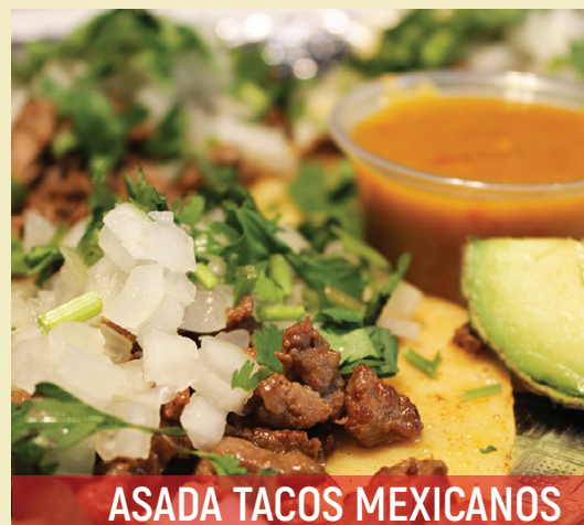
ASADA TACOS MEXICANOS