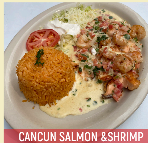
CANCUN SALMON & SHRIMP