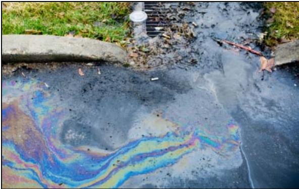
Millers River Watershed Council

You can identify a storm sewer by the open grates along roadways and within some low-lying areas.