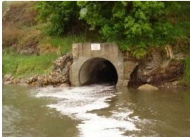
Terra Erosion Control, Ltd.

To report a suspected stormwater discharge violation, call: 1-844-DEC-ECOS (1-844-332-3267)