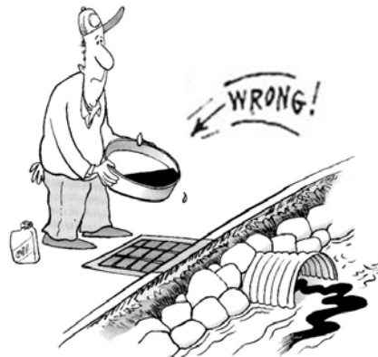
Solid Waste Institute of Northeast Oklahoma

The point in a storm sewer system where it empties into a body of water is a storm sewer outfall. It may be a pipe or ditch. If the outfall is flowing when there has been no recent rainfall, this may indicate an illicit discharge. Visible sewage waste, foul odor, suds or other evidence of contamination, are indicators that an illicit discharge is contaminating the storm sewer.