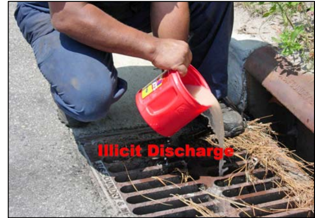
City of Portage, Michigan