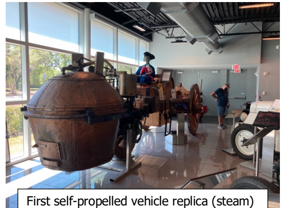
First self-propelled vehicle replica (steam)