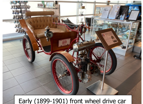
Early (1899-1901) front wheel drive car