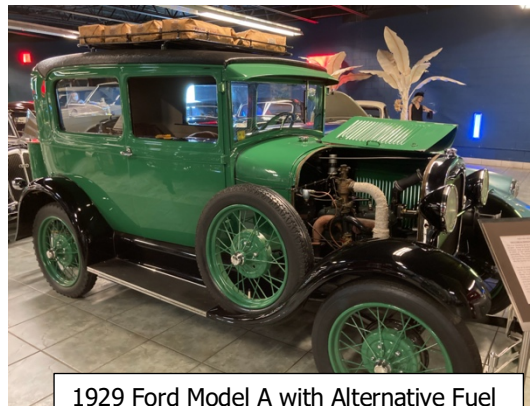
1929 Ford Model A with Alternative Fuel