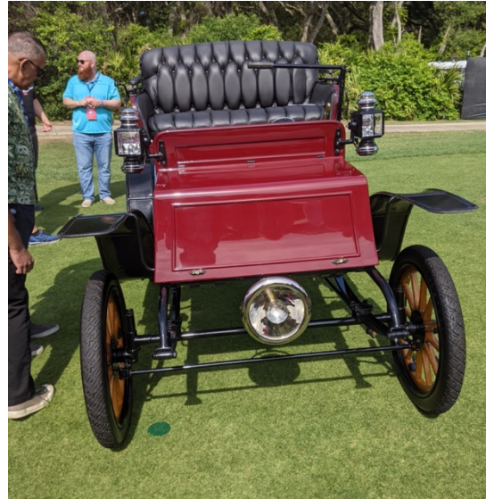
A 1909 Model 13a Studebaker Electric at Amelia. Believed to be the only surviving example, Car is now on loan to the AACA and will be displayed for years.

On the "trip north", we visited a new museum in Clearwater which features a collection of early industrial engines (both steam and gasoline). Can you envision a flywheel about sixteen feet in diameter? Permits are in process to install a steam generator to make them operational! Lots of brass-era cars, and an early fire engine are also presented. The facility also emphasizes education, and has a classroom set up to better interact with school-age visitors. Oh yes, the name? Collection on Palmetto