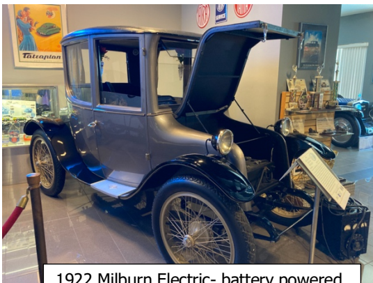
1922 Milburn Electric- battery powered