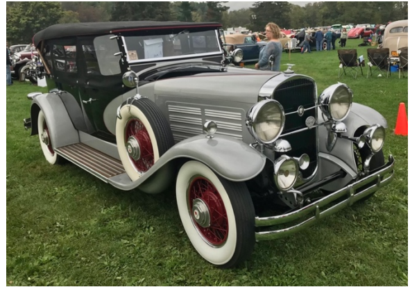
1931 Jordan "Somewhere West of Laramie" Phaeton. How could you not like this rarity?