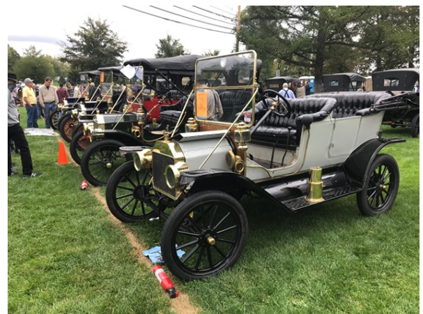
Brass Model T's, each one nicer than the other.