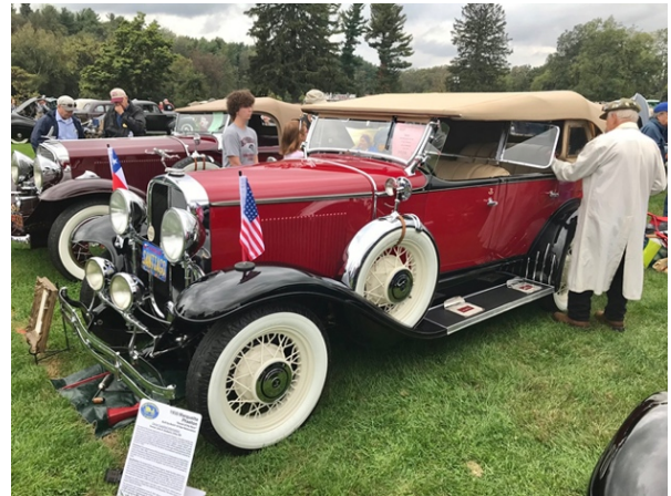
1930 Marquette (companion car to Buick). The gentleman who owned it was from central Ohio, but winters in Fort Myers and is contemplating moving to SW FL full-time. Yes, I gave him my card and asked him to join the Naples-Marco Region!