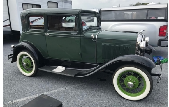
For Sale in the Chocolate Field. 1931 Model A Ford Victoria Coupe, asking $18,500 and the seller was ready to make a deal.