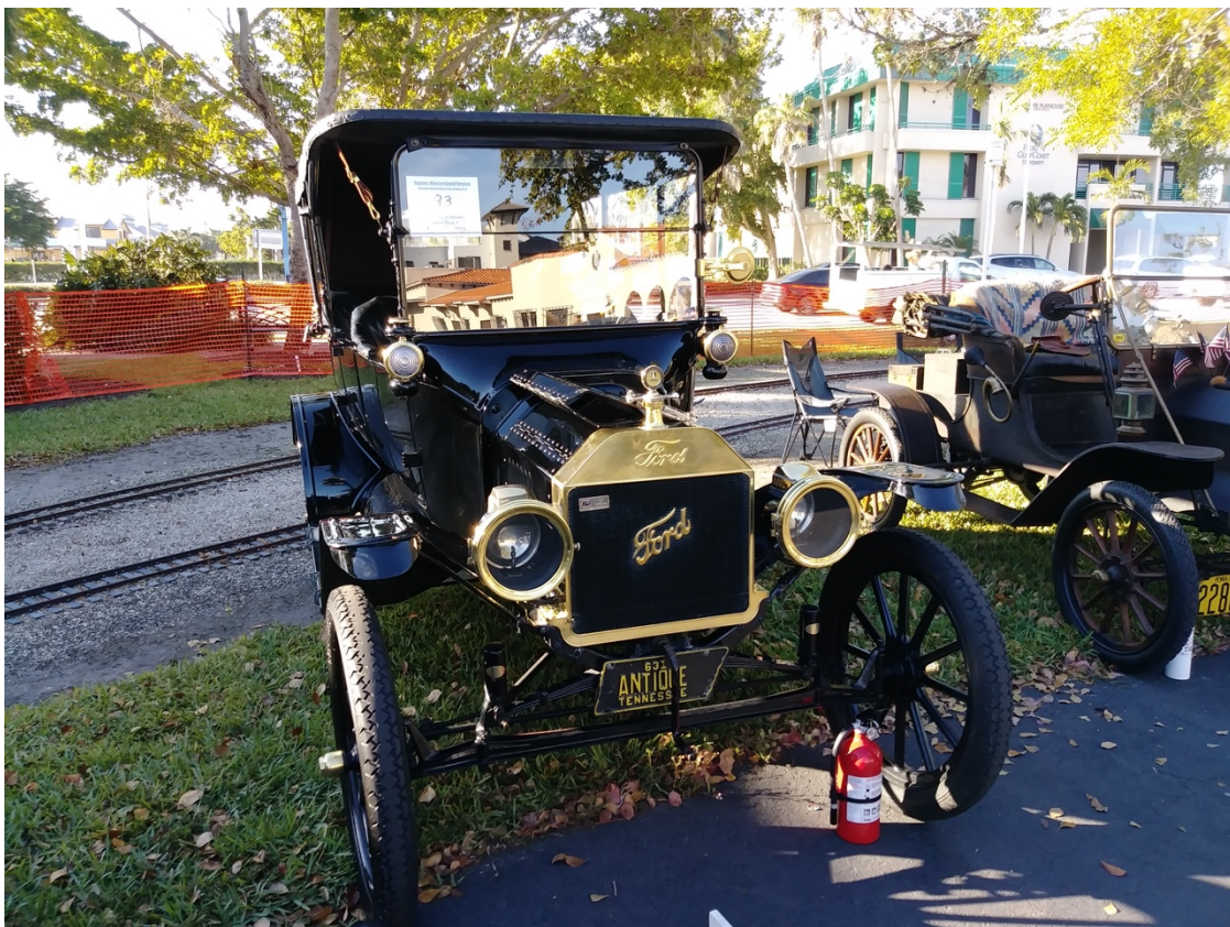
Garland Pobletts' 1915 Ford Model T Touring Car