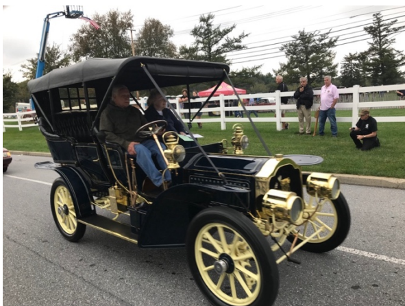
Fabulous 1906 Packard on its way to the show field.