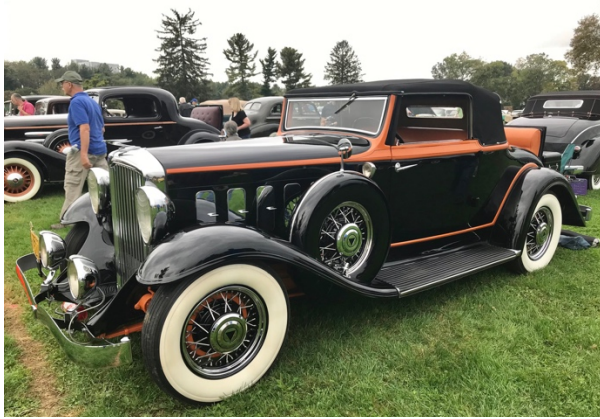
1932 Hudson Eight, what a rare and magnificent sight.