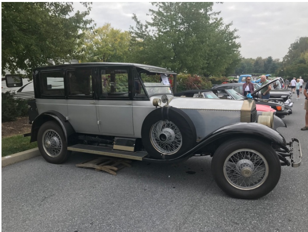
A 1927 Rolls-Royce Springfield Silver Ghost in the car corral. Only about $100,000 more than I wanted to spend.