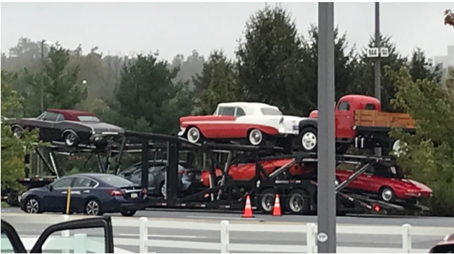
Some people brought more than one car to sell in the car corral. I'm not sure about what that new gray SUV thing was doing on the trailer.