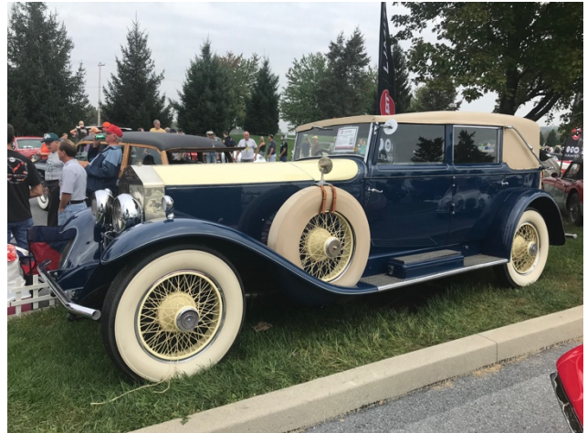
A Rolls-Royce Phantom I circa that I needed, again about $100,000 over my thinking.