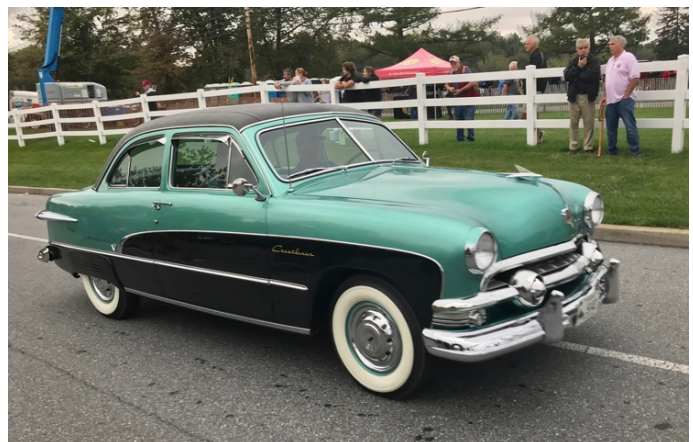
1951 Ford Crestliner, Ford's answer to Chevrolet's hard-tops.