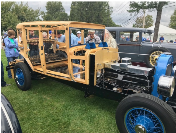
Talk about rare, two DuPonts side-by-side, one completed and one restoration in progress.