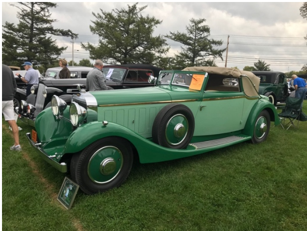
Classic Hispano-Suiza. Wow!