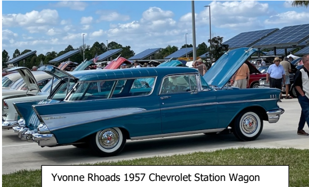
Yvonne Rhoads 1957 Chevrolet Station Wagon