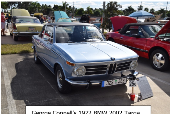
George Connell's 1972 BMW 2002 Targa