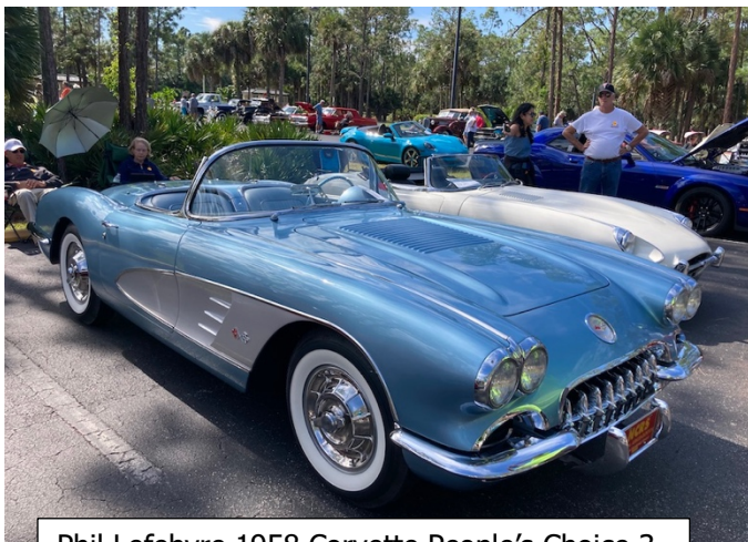
Phil Lefebvre 1958 Corvette People's Choice 3