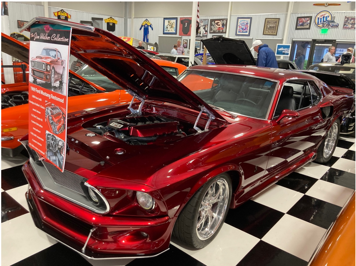
1969 Ford Mustang Restomod from Jim Walker Collection