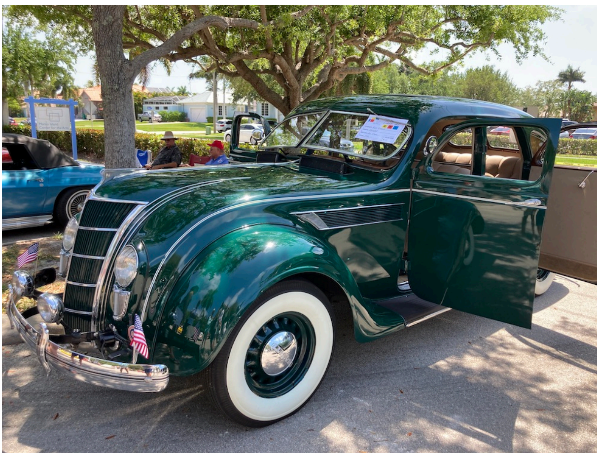
1935 Chrysler Airflow at the Marco Island "Cars as Art" Show