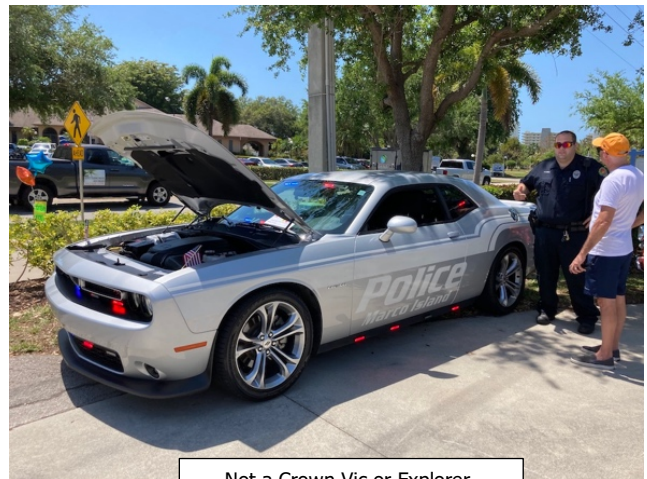
.... Not a Crown Vic or Explorer