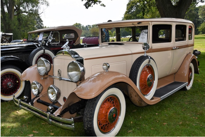
1931 Packard 463