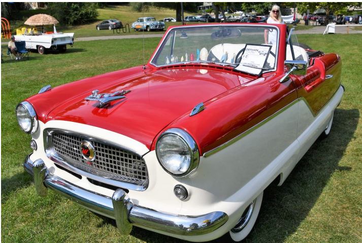
1960 AMC Metropolitan

Here are some photos of the 2022 Orphan Car Show in Ypsilanti Michigan. This show features cars that are no longer in production. The Hudson photo on the cover was also taken here.