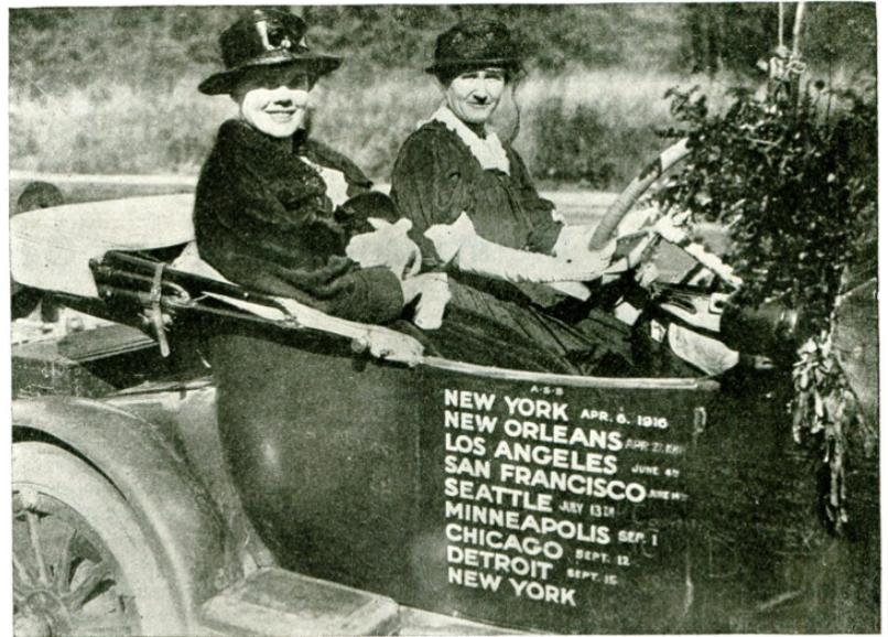
SUFFRAGE PILGRIMS COMPLETE U. S. TOUR