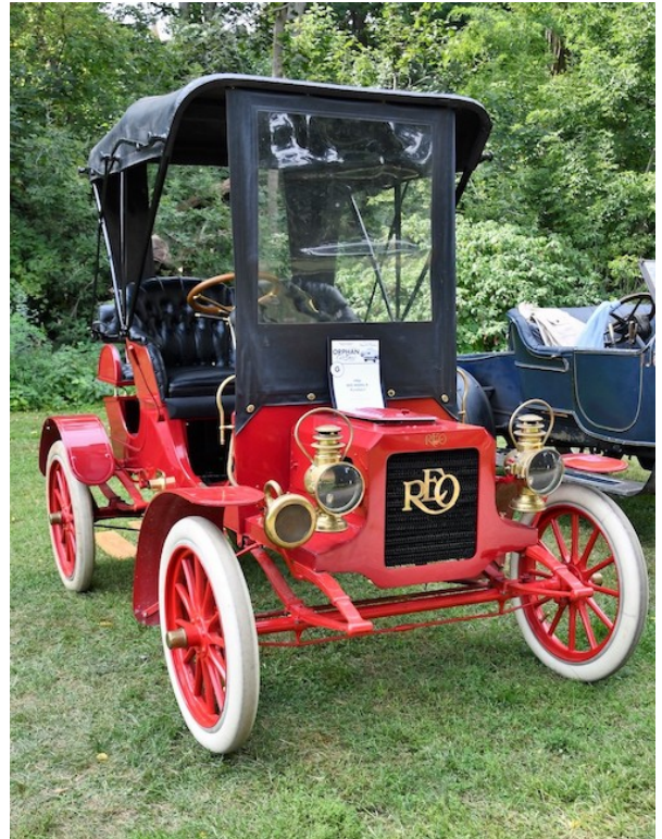
1906 Reo Model B Runabout