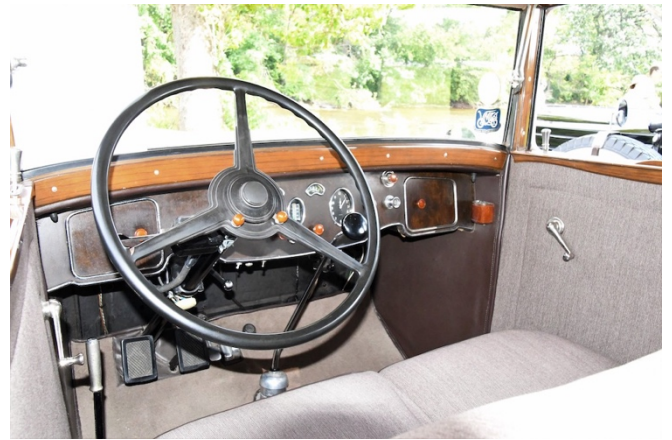
1931 Packard 463