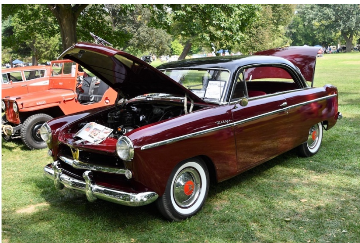
1953 Willys Aero Eagle