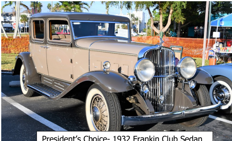
President's Choice- 1932 Franklin Club Sedan