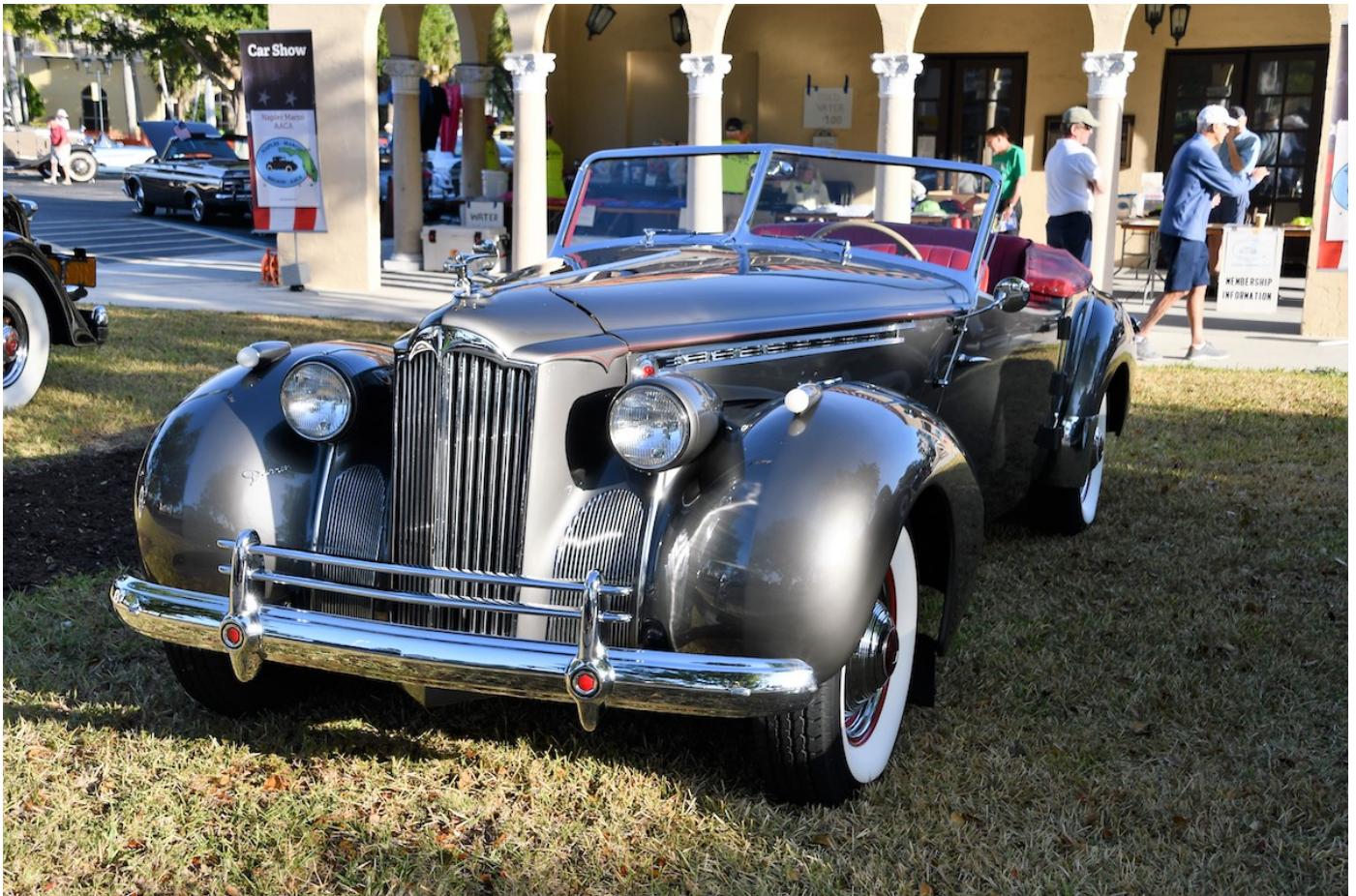
1940 Packard Darrin