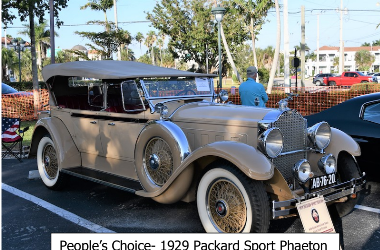
People's Choice- 1929 Packard Sport Phaeton

This year's show featured ~80 cars by both members and non-members of the Naples-Marco AACA. Estimates are that ~1000 people attended the show. The show featured unmodified cars from the early 1900's thru 1998. Four cars received special recognition and are shown below.