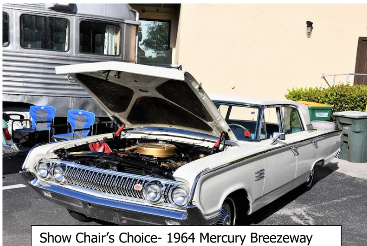
Show Chair's Choice- 1964 Mercury Breezeway