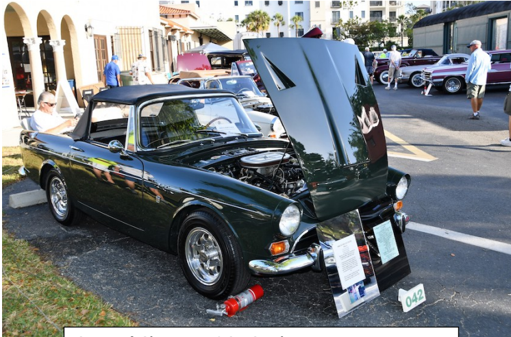
Scouts' Choice -1965 Sunbeam Tiger