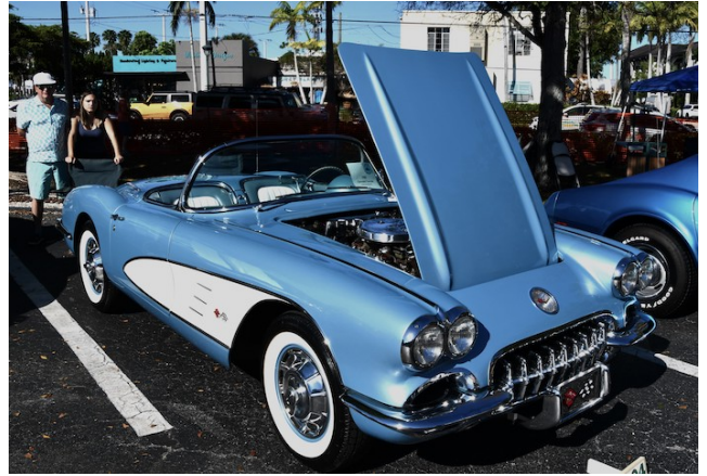
People's Choice - Paul Schwinghammer 1960 Chevrolet Corvette