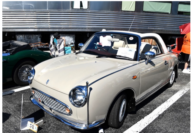
Scout's Choice - Adele Duba 1991 Nissan Figaro