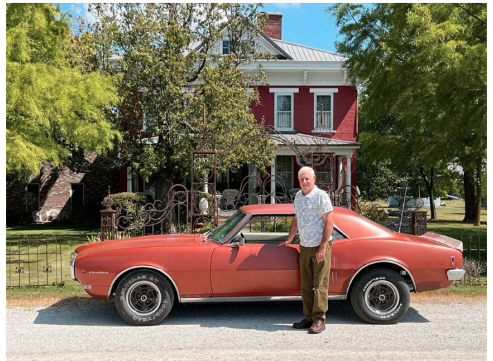
Submitted by Malcolm Newbourne