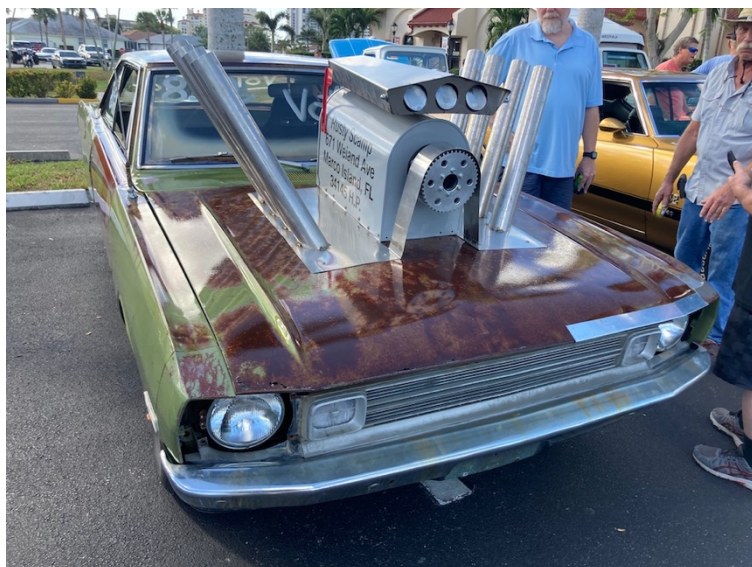
Above- Not an AACA car at the 11/9 Knights of Columbus Show in Marco Island