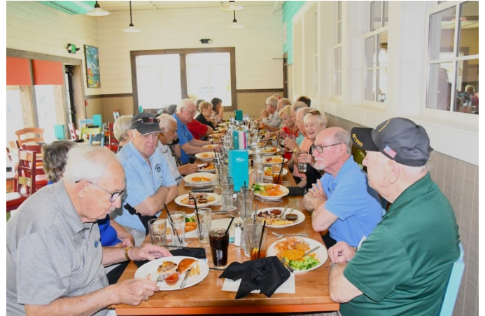
Holiday Luncheon at the Bahama Breeze Restaurant in Naples