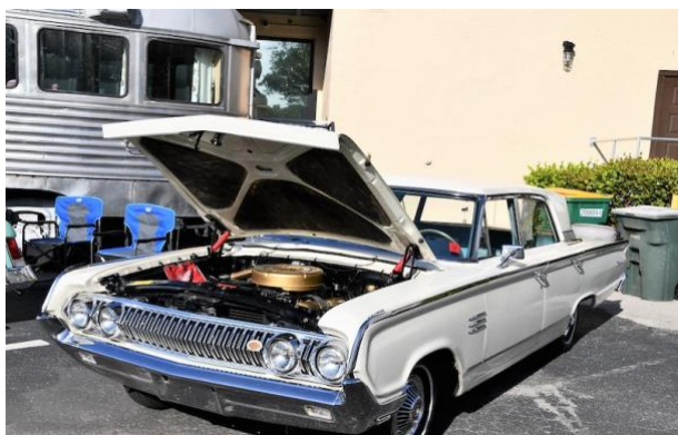
Show Chair's Choice- 1964 Mercury Breezeway