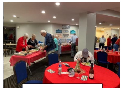
Dec. 11 Holiday Party