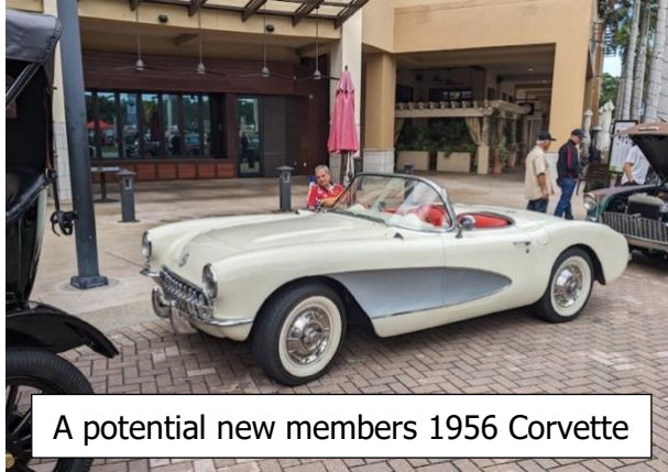
A potential new members 1956 Corvette

Our club was featured at the Dec. 17 Mercato event. We had several cars on the circle as shown on the cover and below.