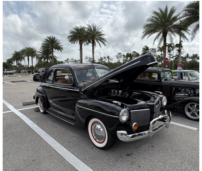
Garland Pobletts '41 Mercury Coupe. See the engine photo on the cover.