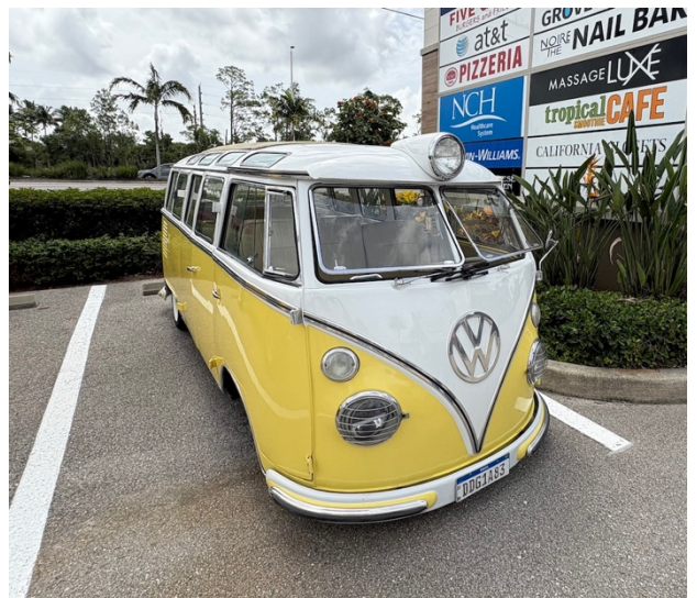
The owner had this VW van shipped to US from Brazil. Note the top headlight is not original to this van.