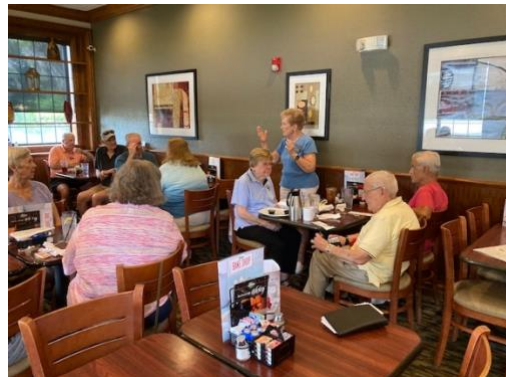
From May 11 Meeting at Perkins

Important Notice: Luncheon/meeting, Sat. June 8, 12:00 noon at Perkins Restaurant, 3585 Pine Ridge Road (near I-75 exit 107). Bring your car.