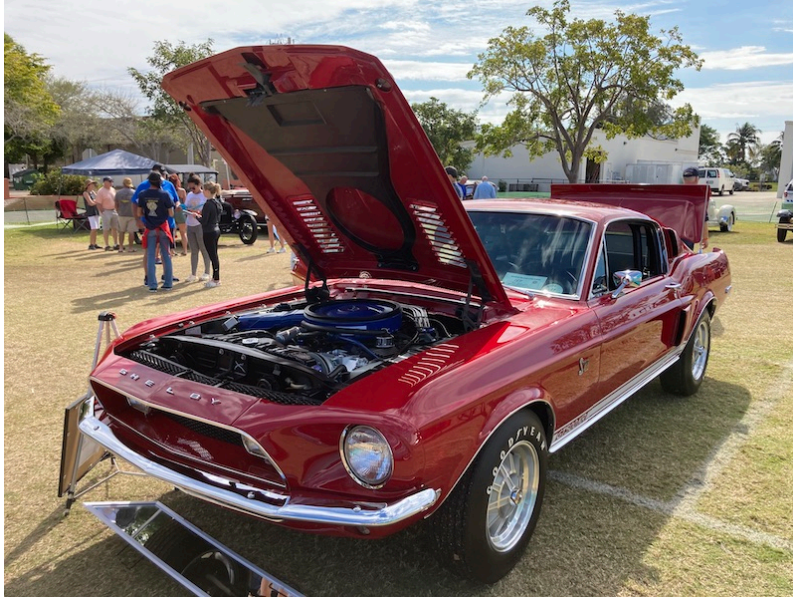
A 1968 Shelby Mustang, only 16 produced like this one. A "Best in Show" winner at Cars on 5 th .

A new, larger, location this year. Number of cars there was estimated at ~150, (lots of extra spaces). Attendance estimated at ~2300.