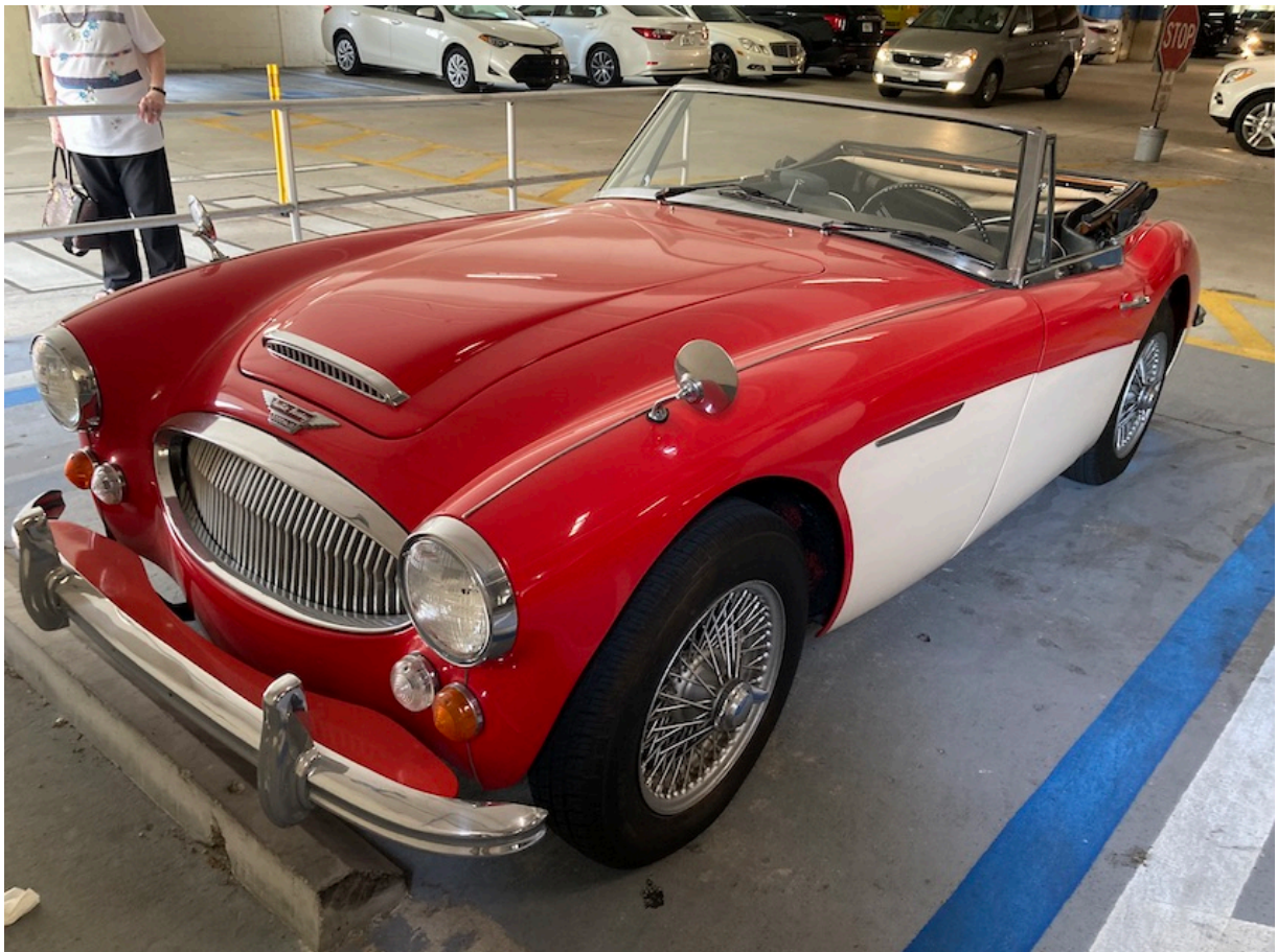
Austin Healey 3000 Mk III at NCH Parking Garage