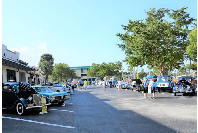
From the 2023 Depot Show