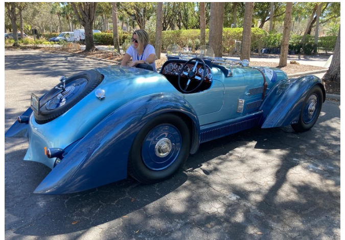
One of the entrants of the 1000 Miglia event during a 2/23 stopover at the Ritz Tiburon in Naples