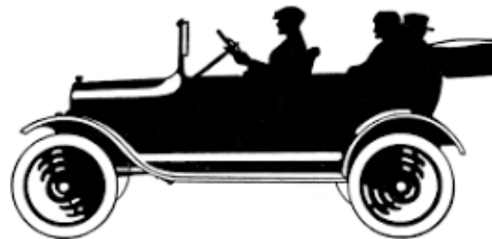
Naples/Marco Region AACA Car Show. March 15, 2025