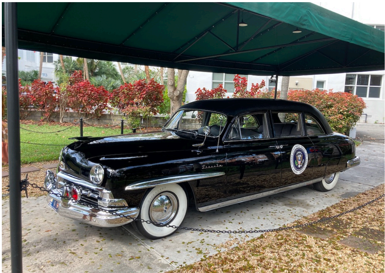
Harry S. Truman's 1950 Lincoln Cosmopolitan Limousine