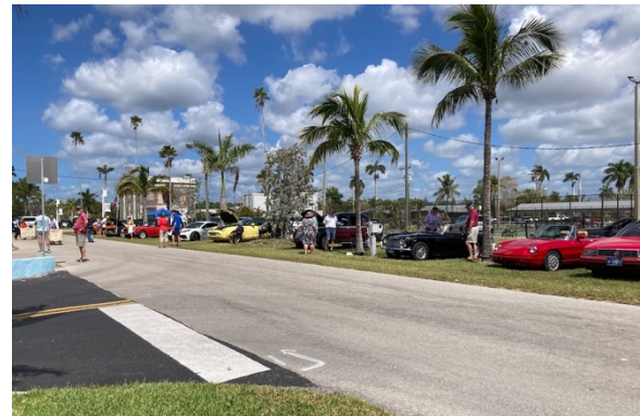
Everglades City April 26