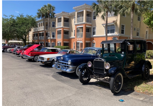
Aston Gardens April 24

Locally, our club was engaged in 2 events in April. On April 24 we had ~13 cars participate in an event at Aston Gardens. We had a good selection of cars there and thanks to those that brought theirs. The Aston Gardens "Director of Celebrations" was well pleased and told us she will be contacting us again next year. On Saturday April 26, a like number of us travelled to Everglades City to mark the 97th anniversary of the completion of the Tamiami Trail, and the birthday of the Collier County Museum of the Everglades. Photos are here and page 6.