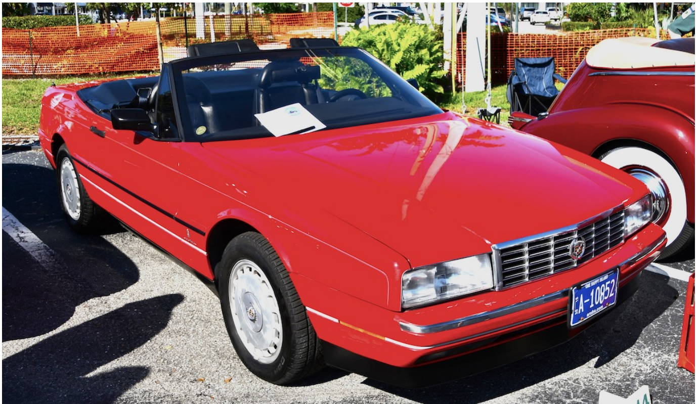
Scott Slye's 1989 Cadillac Allante at 2024 Depot Show