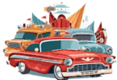
Naples-Marco AACCA Car Show March 15, 2025 North Naples Church

Registrations have been steadily received, so if you haven't registered yet, please do so as soon as you can. We are now reaching out to all owners who previously