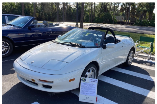
Peter Blackford 1991 Lotus M100 -Rookery Bay