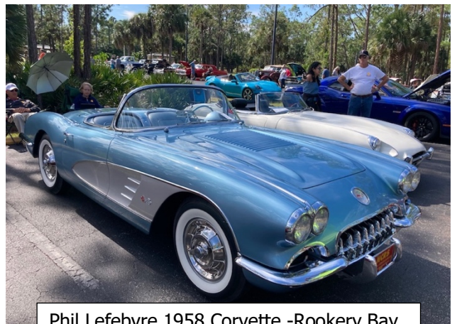
Phil Lefebvre 1958 Corvette -Rookery Bay