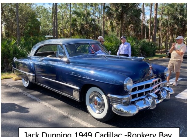
Jack Dunning 1949 Cadillac -Rookery Bay