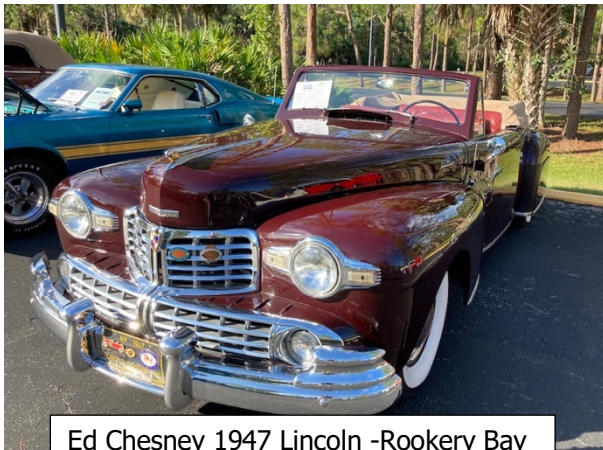
Ed Chesney 1947 Lincoln -Rookery Bay