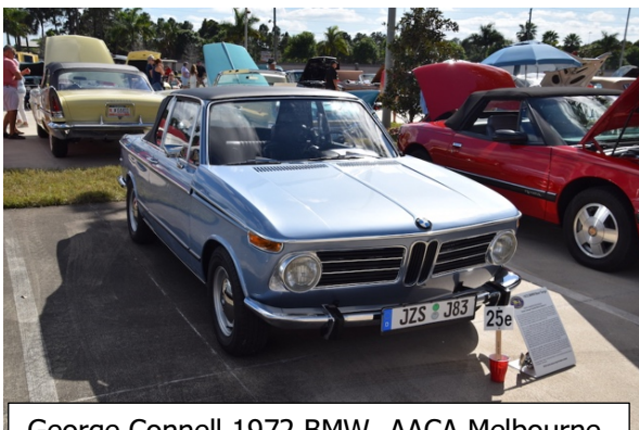
George Connell 1972 BMW -AACA Melbourne