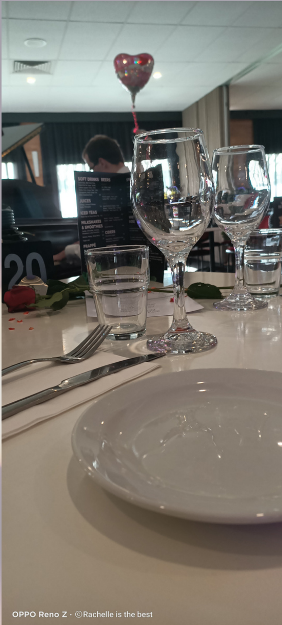
OPPO Reno Z