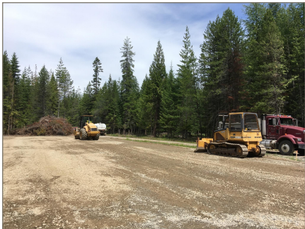
New Parking lot at Section 16

We were also able to meet our 2020 goals in record time by connecting and completing Power Brush and Social Distancing looped trails, construct a new trailhead parking lot, install trail signage, and build an informational kiosk.