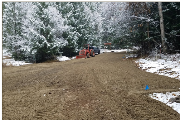
Parking lot greatly improved