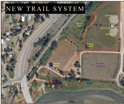
Riverside Park 2021

In January 2019, 9B Trails applied for the Recreational Trails Program (RTP) grant through the Idaho Department of Parks and Recreation. RTP provides funding to develop and maintain non-motorized recreational trails and trail-related facilities.