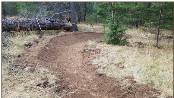
A banked turn for added challenge and fun