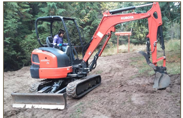
No task is too big for Olivia at Enchanted Forest

Drake understands the value of getting outside, the power of connecting with our natural surroundings, and the sheer fun found in nature.