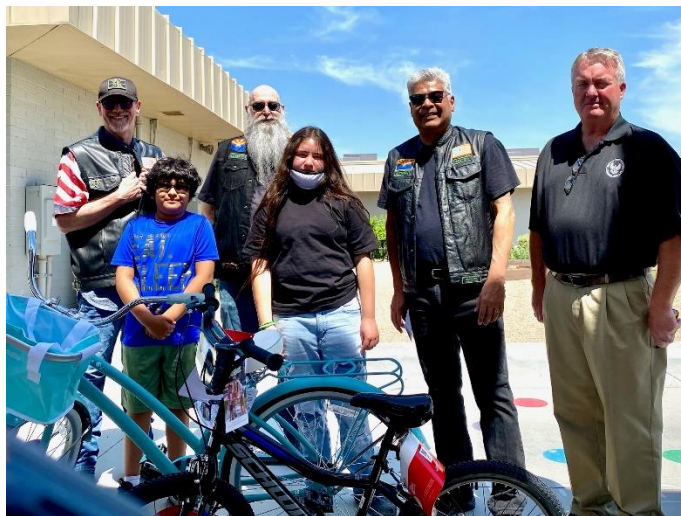
The Brethren of the Riders of the 3 rd Degree and Phoenicia #58 teamed up in May to present deserving students at Sunset Canyon Elementary with new Chrome Books.