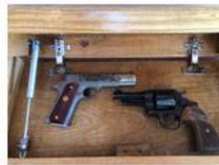
CHILD SAFETY ACCESS