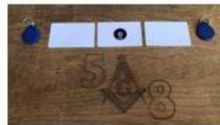
RFID LOCKING SYSTEM