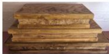
MULTIPLE SIZES 20, 25, 30 INCH X 11 INCH