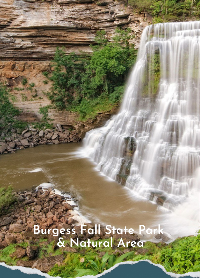
Burgess Fall State Park & Natural Area