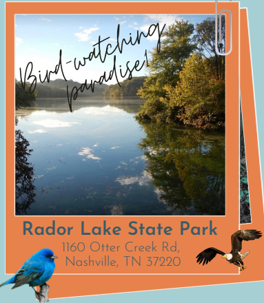
Radnor Lake State Park 1160 Otter Creek Rd, Nashville, TN 37220

Radnor Lake Park is a 1,368-acre day-use park & has 7.75 miles of trails. It is unique due to the abundance of wildlife viewing, environmental programs, hiking and its location in an urban area.