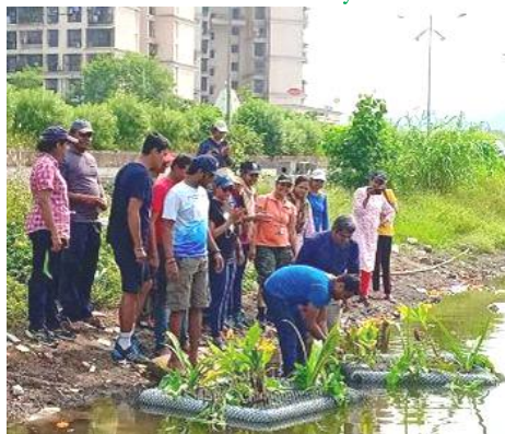
Celebrating Clean-Up the World Campaign through community actions

Ladybird installed a Floating Wetland in Kharghar, Navi Mumbai for Tata Consulting Engineers Ltd. Also a clean-up drive was conducted inside Asola Bhatti Wildlife Sanctuary, Delhi for CRISIL Foundation. In Maharashtra, two Butterfly Habitats at Yusuf Meherali Centre, Tara and Divya Vidyalaya, Jawhar were developed by planting 4000 saplings by employees of DCB Bank.