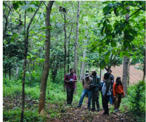
Celebrating World Elephant Day first time in Bangalore

iNaturewatch designed a unique programme in order to create awareness about elephants in Bangalore. A nature walk and talk was organized inside elephant territory at A Rocha Field Study Centre. Also an Insect Safari was conducted at Nagala, Mumbai and a Teacher Training Workshop at JBNC International School.