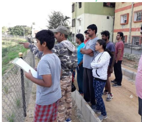
Celebrating World Soil Day through environmental awareness

iNaturewatch conducted nature walk along the agricultural farms behind the Kharghar Railway Station. A kitchen gardening workshop and two lectures KTHM College, Nasik was conducted. A free birding walk was also conducted at Nizampet Lake in Hyderabad.