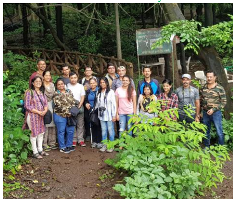
Celebrating Wildlife Week through Butterflying

iNaturewatch conducted butterfly walks inside Kamala Bird Sanctuary in Mumbai and Jarakbande Butterfly Park in Bangalore. Also a wildflower walk for a nature club Kilibahat and mangrove walk for Udaan Foundation was conducted in Navi Mumbai