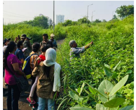
Celebrating World Environment Day through nature appreciation

iNaturewatch conducted monsoon walks in Kharghar Valley, Navi Mumbai and in Muthuraynabetta in Bangalore. Also a nature trail inside Aarey Forest was conducted for a family group.