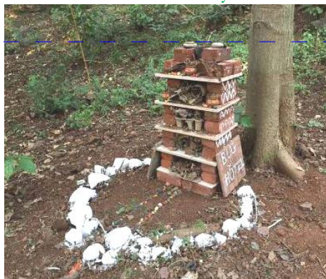
Celebrating Dr. Salim Ali's Birthday by creating homes for wild

Ladybird developed nature trails, bird and bug homes through volunteering programme of L'Oreal India Pvt Ltd coordinated by United Way Mumbai in CBD Belapur. Also conducted Kitchen Gardening Workshop for Wells Fargo India Solutions Pvt. Ltd in Bangalore.