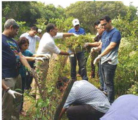
Celebrating Animal Fortnight through habitat restoration

Ladybird conducted events for DCB Bank in Kolkatta and Ahmedabad where their employees helped in Lake Clean up at Rabindra Sarovar and spruced up nature trail at Serenity Library.