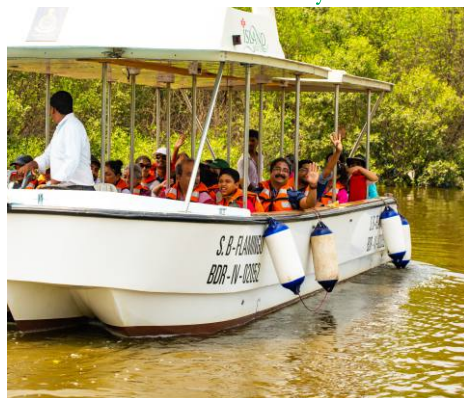
Celebrating Earth Day by appreciating its wildlife

iNaturewatch conducted Flamingo Boat Safaris through the Coastal Marine Biodiversity Centre in Navi Mumbai. The safari gave participants & opportunity to view flamingos at close quarters.