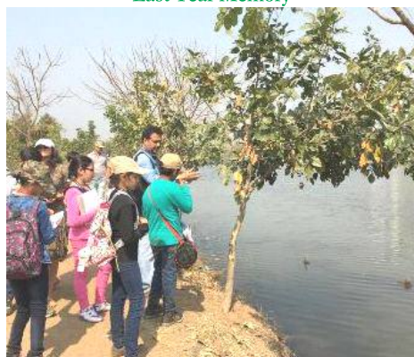
Celebrating World Wetland Day through education

iNaturewatch conducted mangrove walks for Vishwajyot High School and Sacred Heart School at Talawe in Navi Mumbai. Also conducted a free birding programme as part of the Kere Habba Festival in Kaikondrahalli Lake, Bangalore.