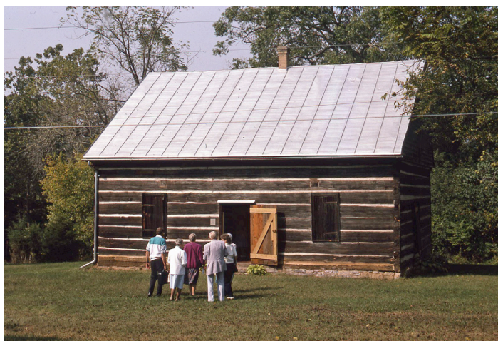
Mauck Meetinghouse, built late 18th century, used by Mennonites before they migrated west of the Blue Ridge Mountain.