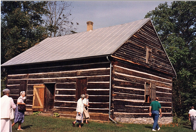
Mauck Meetinghouse, near Luray, Virginia. Pictured above are participants on the Shenandoah Valley Mennonite Historians tour September 17, 1994. Harmonia Sacra singing events have been held annually at the facility since 1922. The building is located at 223 Hamburg Rd., Luray, Virginia.