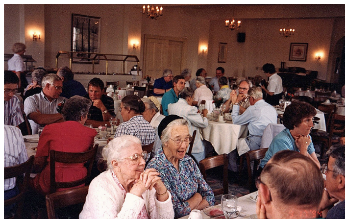
Tour members ate at Mimslyn Inn, Luray, Sept., 1994.