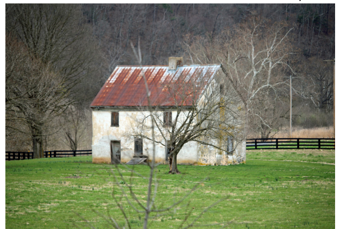
Large scale copies of these photos can be viewed at www.flickr.com/photos/mennonitearchivesofvirginia/albums