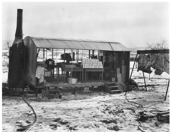
The 1940s canner set up to can meat.