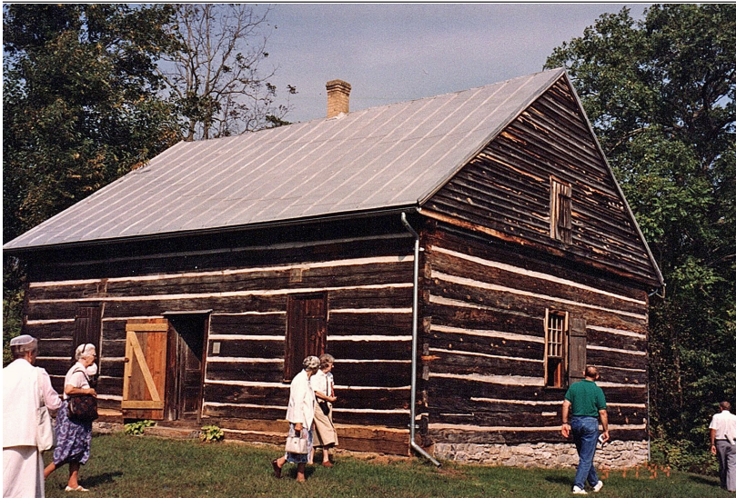
Mauck Meetinghouse, near Luray, Virginia. Pictured above are participants on the Shenandoah Valley Mennonite Historians tour September 17, 1994. Harmonia Sacra singing events have been held annually at the facility since 1922. The building is located at 223 Hamburg Rd., Luray, Virginia.