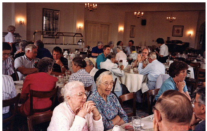
Tour members ate at Mimslyn Inn, Luray, Sept., 1994.