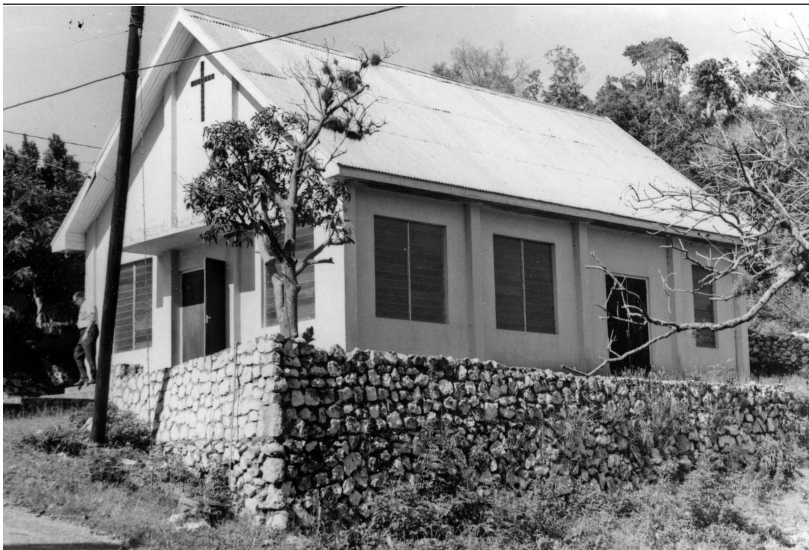
Alpine Mennonite Church, Kingston, Jamaica, 1968. The Alpine Church was a missions outreach of the first Mennonite church in Jamaica, Good Tidings Mennonite Church, established by Virginia Mennonite Board of Missions. Virginia Mennonite Missions agency will celebrate its Centennial in 2019.