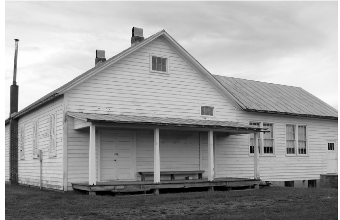
Stuarts Draft Amish Church, Augusta County, Virginia, with adjoining high school annex.

A local community policeman’s wife mused why the low crime rate in Stuarts Draft? She thought likely the presence and influence of the Amish were a part of the answer. It was also observed that community people more