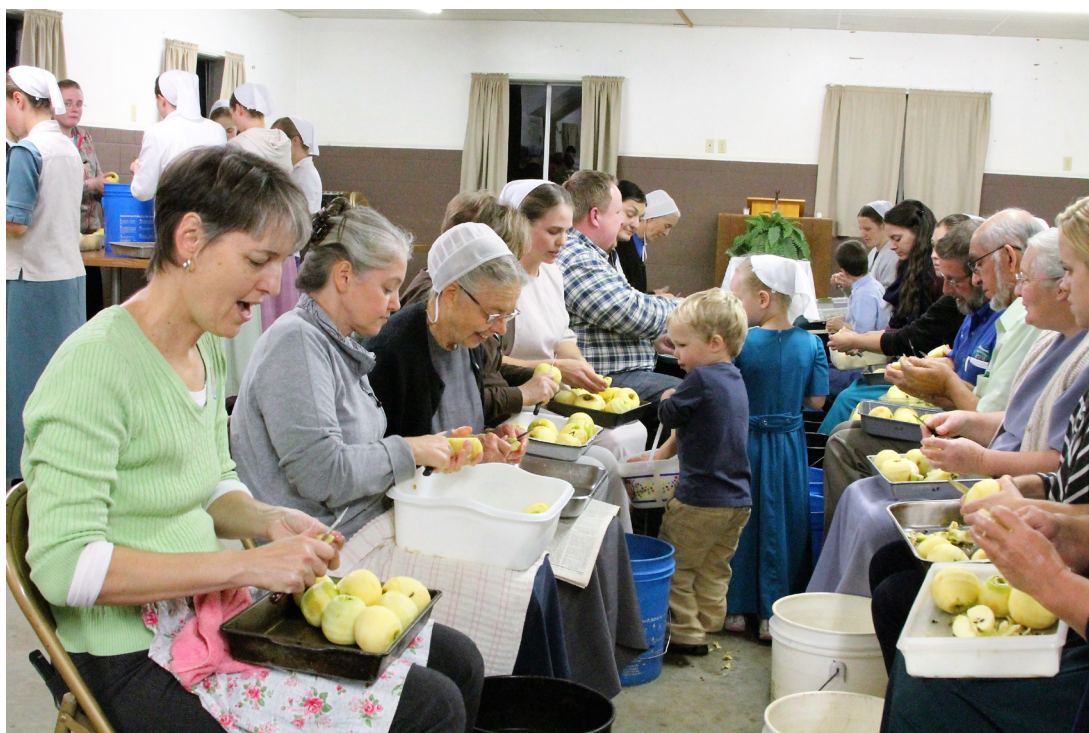
Apple Cutting at Pilgrim Christian Fellowship Mennonite Church, affiliated with the Beachy Amish churches, Augusta County, Virginia, 2015.

Spare time was channeled into cutting up beeves for the hungry overseas as well as a Grundy, Virginia, orphanage. An Amish family would sometimes donate an entire cow to Mennonite Central Committee for relief across the Atlantic which the church people would