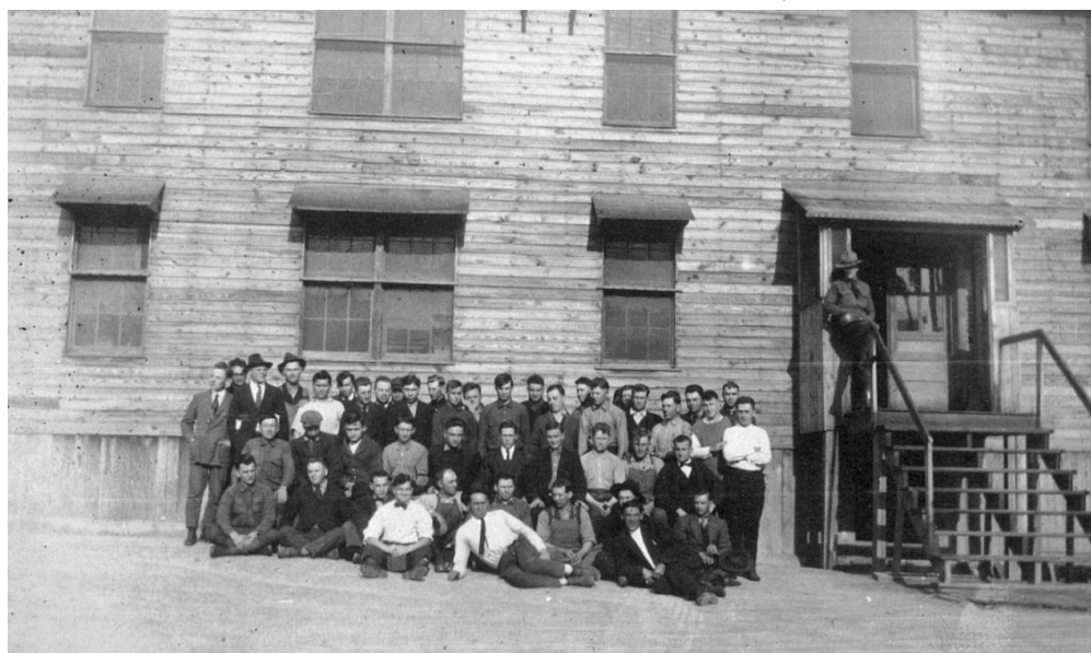
Camp Lee, Virginia, Conscientious Objectors 1918