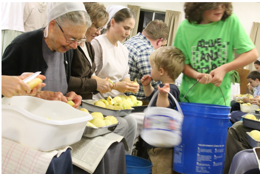
Apple Cutting at Pilgrim Christian Fellowship Mennonite Church, Augusta County, Virginia, 2015.

This is written by one of those who listened to the preaching of the excellent story telling Amish ministers as he sat barefooted on the wooden bench during those peaceful summer Sunday mornings while glancing through the open church doorway at the beautiful Blue Ridge Mountains. Some prefer elaborate massive ornate cathedrals but I would opt for this simple idyllic setting for a meaningful worship service. Singing the slow-tuned Ausbund Hymnal 400-year-old songs written by Anabaptist Christian martyrs while sitting in dungeon prison cells are still deeply touching as I reflect back on the goodness and faithfulness of God.